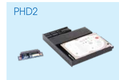
PHD2 XS35 series Accessory for XS35 series to support a second hard disk drive