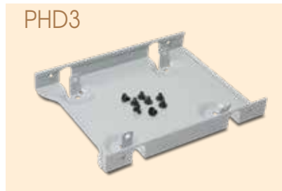
PHD3 XPC-cube series 3.5" to 2.5" HDD rack for XPC cube series