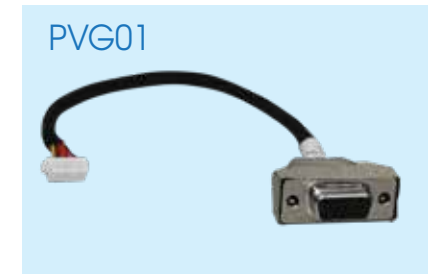
PVG01 DH270/DH170/DQ170/DH110/XH110V/DX30 VGA port accessory for DH series, DQ170, DX30