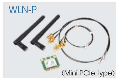
WLN-P XPC-cube and slim series 802.11ac/b/g/n WLAN + BT kit