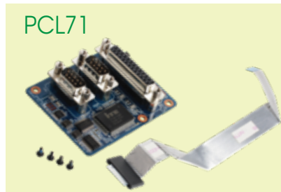
PCL71 X50V4 / X50V5 / X50V6 COM/LPT daughter board for X50 series