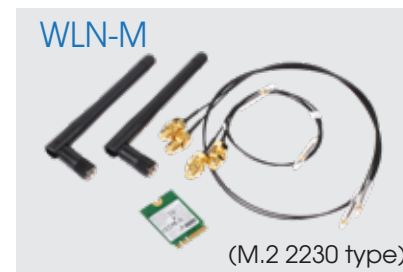
WLN-M XPC-cube and slim series 802.11ac/b/g/n WLAN + BT kit