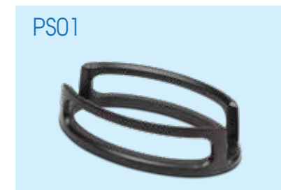
PS01 XH270/XH170V/XH110 series Vertical stand accessory for 3-liter Slim PCs