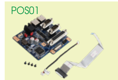
POS01 X50V4 / X50V5 / X50V6 COM/LPT/Cash drawer daughter board for X50 series