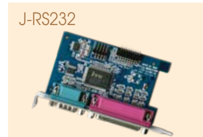
J-RS232 XPC-cube series RS232 daughter board for XPC cube series