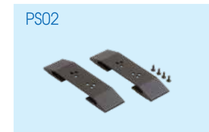
PS02 DH series/DQ170/DX30/DL10J Vertical stand accessory for 1-liter Slim PCs