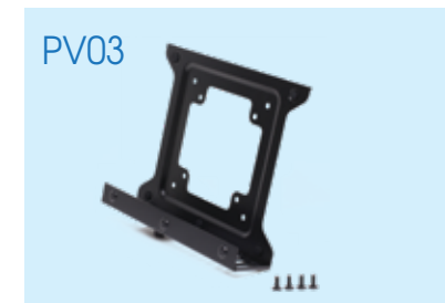
PV03 XS36 series VESA mount accessory for XS36 series