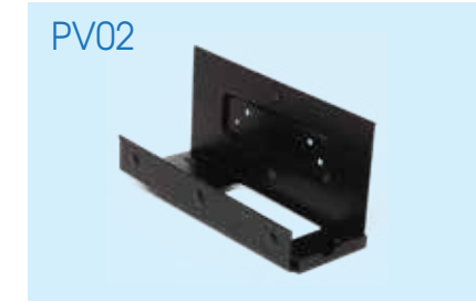
PV02 XH270/XH170V/XH110 series VESA mount accessory for 3-liter Slim PCs