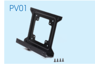
PV01 XS35 series VESA mount accessory for all XS35 series models