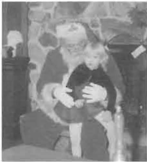
Santa with one of our guests.