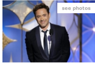
The 2014 Celebrity 100