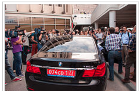
Arrival at Sheremetyevo Airport in Moscow on June 23, 2013

On June 23, 2013, Snowden landed in Moscow's Sheremetyevo international airport. [195][196][197] Wikileaks stated that he was "bound for the Republic of Ecuador via a safe route for the purposes of asylum". [198] According to Gellman, Snowden "didn't choose Russia. He was literally changing planes in the Moscow airport when the United States revoked his passport. He was stuck there by that. He's said from the beginning that he wanted asylum in a Western country, for example, Iceland, that, from his point of view, respects rights of free speech and whistleblowers. He is not looking to live in a country like Russia or China." [199] A US official said that Snowden's passport was