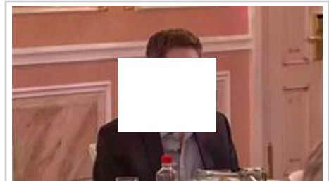
Edward Snowden speaks about various topics at the Sam Adams Award presentation in Moscow

[270] [271] In the video, Snowden said "people all over the world are coming to realize" that the NSA's surveillance programs put people in danger, hurt the US and its economy, and "limit our ability to speak and think and live and be creative, to have relationships and associate freely" as well as putting people "at risk of coming into conflict with our own government". [272]