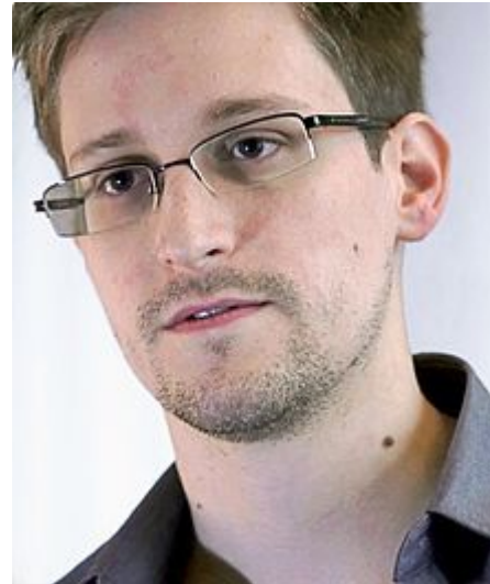
Screen capture from the interview with Glenn Greenwald and Laura Poitras on June 6, 2013