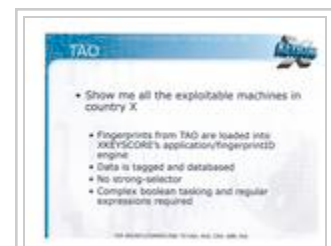
A reference to Tailored Access Operations (TAO) in an XKeyscore slide