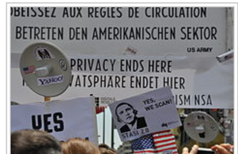
Demonstration at Checkpoint Charlie in Berlin against the NSA surveillance program PRISM during Barack Obama's visit, June 18, 2013

Director of National Intelligence James Clapper condemned Snowden's actions as having done "huge,