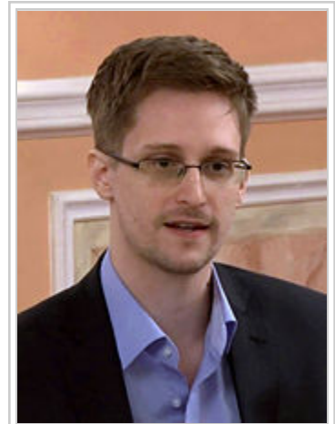
Edward Snowden during the Sam Adams Award ceremony in Moscow, October 2013

Snowden's passage through Hong Kong inspired a local production team to produce a low-budget five-minute film entitled Verax . The film, depicting the time Snowden spent hiding in the Mira Hotel while being unsuccessfully tracked by the CIA and China's Ministry of State Security, was uploaded to YouTube on June 25, 2013. [395][396]