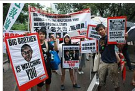
Protesters rally in Hong Kong to support Edward Snowden, June 15, 2013

In May 2013 Snowden took a leave of absence, telling his supervisors he was returning to the mainland for epilepsy treatment, but instead left Hawaii for Hong Kong [166] where he arrived on May 20. Wikileaks reported that he was seeking asylum in Iceland because of the country's "shared values". [22][167] Iceland's ambassador to China said Icelandic law requires that asylum applications be made from within Iceland. [168] Snowden explained why he did not go directly from the US to Iceland: "Leaving the US was an incredible risk, NSA employees must declare their foreign travel 30 days in advance and are monitored. There was a distinct possibility I would be interdicted en route, so I had to travel with no advance booking to a country with the cultural and legal framework to allow me to