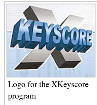
Logo for the XKeyscore program

Slide from an NSA presentation on "Google Cloud Exploitation" from its MUSCULAR program, [105] the sketch shows where the "Public Internet" meets the internal "Google Cloud" where user data resides [106]