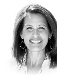
F. Michele Bachmann