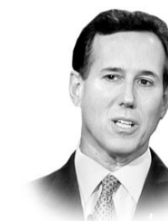
G. Rick Santorum