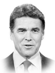
B. Rick Perry