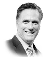
E. Mitt Romney