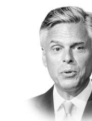
H. Jon Huntsman Jr.