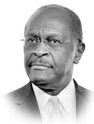
A. Herman Cain