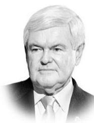
C. Newt Gingrich