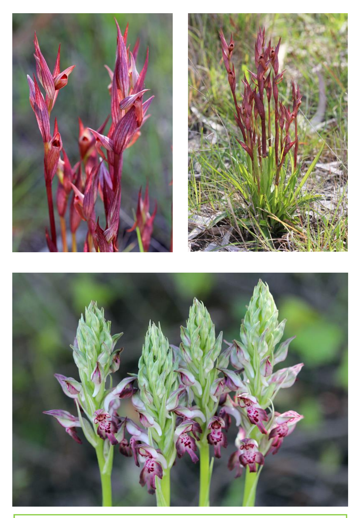
Top: Serapias bergonii. Bottom: Anacamptis fragrans