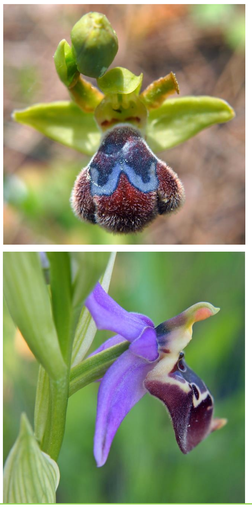
Top: Ophrys omegaifera. Bottom: Ophrys calypsus, by Alan