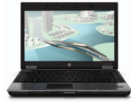
HP EliteBook 8440w Mobile Workstation (Not available in all regions)

Windows®. Life without Walls™. HP recommends Windows 7.