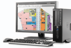
HP Z200 SFF