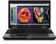
HP EliteBook 8540w Mobile Workstation