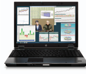
HP EliteBook 8740w Mobile Workstation