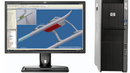
AutoCAD Inventor Professional Suite or AutoCAD Inventor Simulation Suite