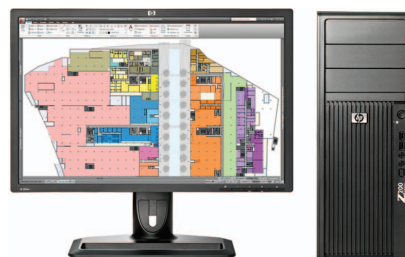
AutoCAD, AutoCAD Architecture, and other AutoCAD based applications