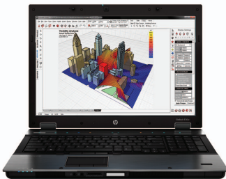
Mobility (for all Autodesk applications)