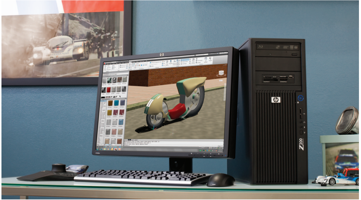
The HP Z200 Workstation is the ideal solution for AutoCAD users.