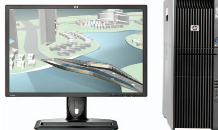
AutoCAD Civil 3D/AutoCAD Map 3D