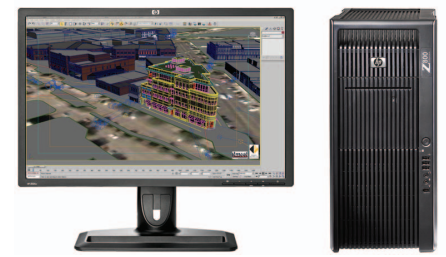
Autodesk Alias, Autodesk Showcase, Autodesk 3ds Max, Autodesk Algor, Autodesk MoldFow, Autodesk Maya & Visualization suites