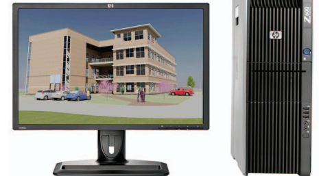
Autodesk Revit Architecture, Structure, MEP