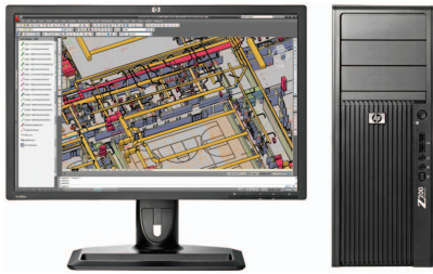
AutoCAD and AutoCAD Mechanical