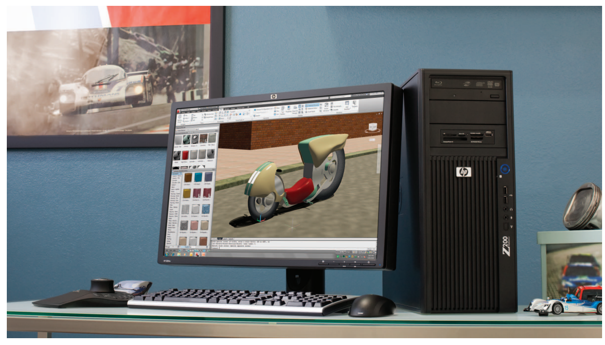
The HP Z200 Workstation is the ideal solution for AutoCAD users.

Windows<sup>®</sup>. Life without Walls<sup>™</sup>. HP recommends Windows 7.