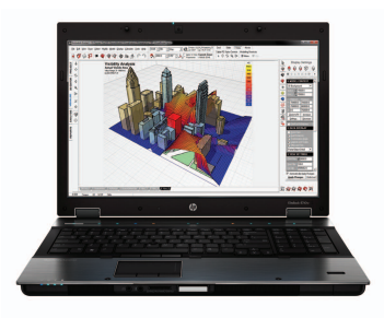
Mobility (for all Autodesk applications)