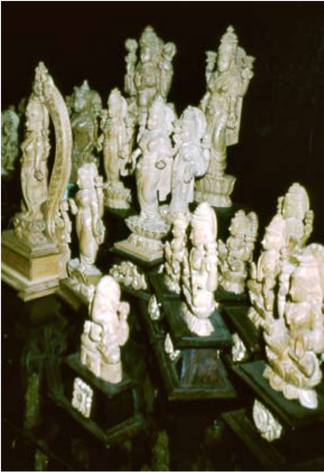
Sandalwood sculptures Bangalore, India.

ing, or wood residue after oil distillation may be used.