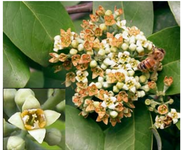
Santalum paniculatum .

corolla is 8–17 mm (0.32–0.67 in) long; its outer surface is dark red and glaucous externally, turning to the same color on the inner surface after opening. The ovary is partly inferior. Flowers produce a weak fragrance.