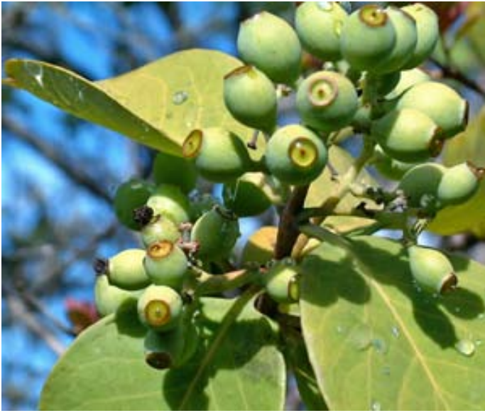
Santalum ellipticum .