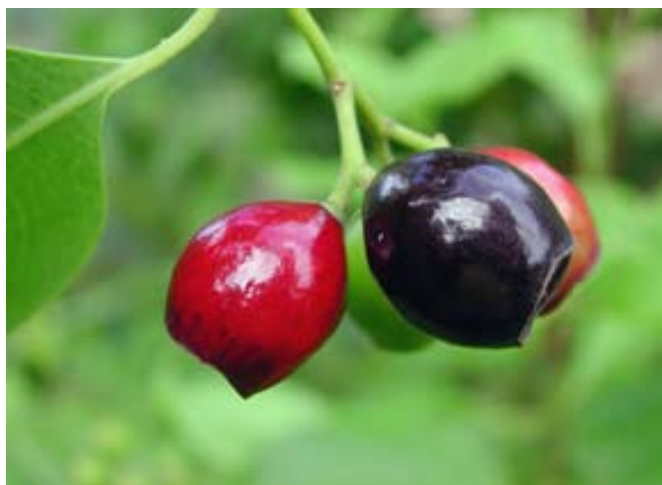
Santalum album fruit.

All species exhibit considerable morphological variation, and numerous traditional varieties are recognized. In the past, taxonomists have divided the extremely variable