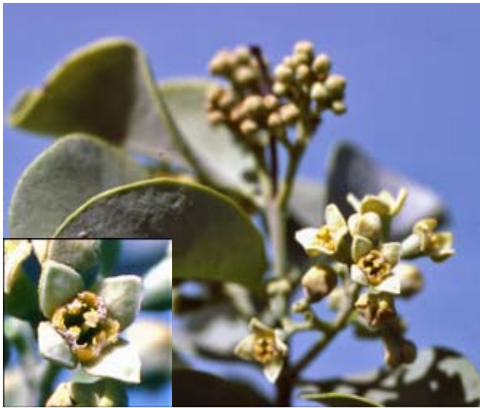
Santalum ellipticum.