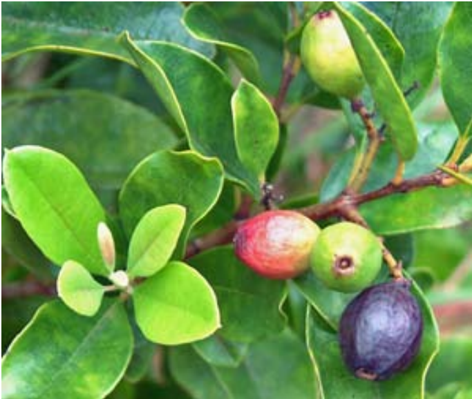
Santalum freycinetianum var. lanaiense.