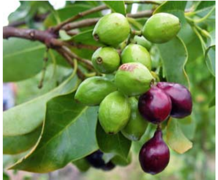
Santalum paniculatum .

occasionally a bit glaucous, more or less wilted in appearance, and tinged with purple when immature.