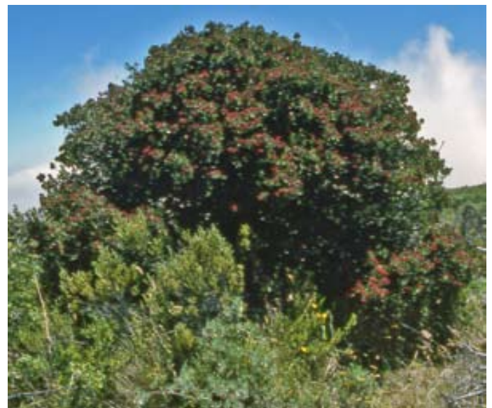
Santalum haleakalae , subalpine region of East Maui.