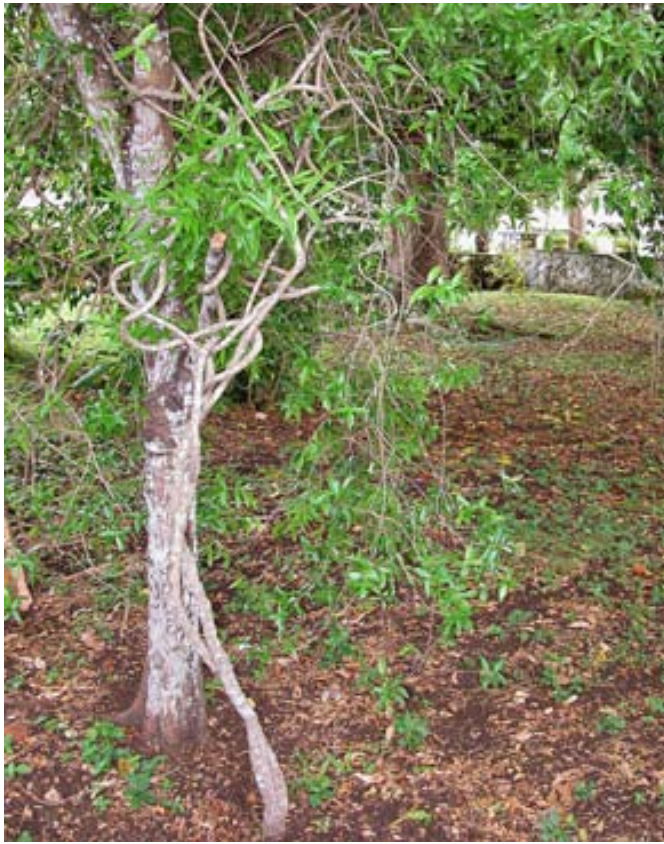
Alyxia stellata , a traditional vine used in leis, climbing on Santalum yasi in a homegarden in Tonga.