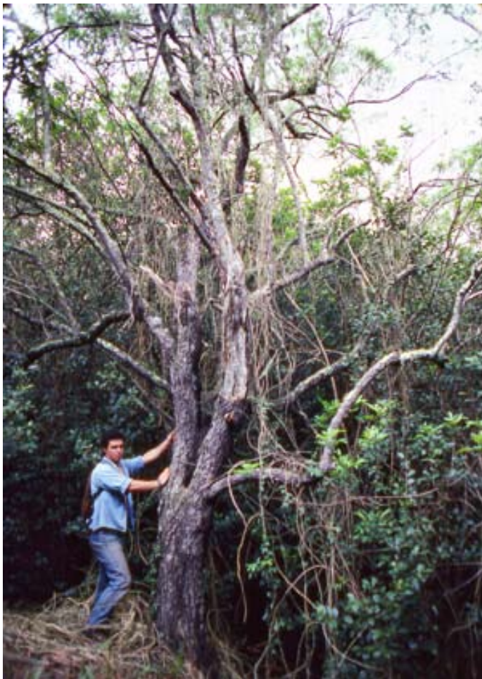
Santalum freycinetianum , southern Wai'anae mountains, O'ahu.