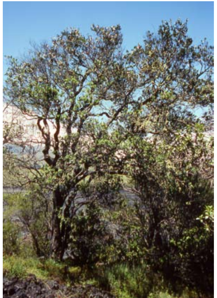
Santalum paniculatum , Pu'uhuluhulu, island of Hawai'i.