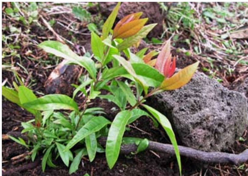
Root shoots of S. paniculatum growing from exposed root.

Many species are capable of root suckering as long as not too much of the root system is removed during harvest.