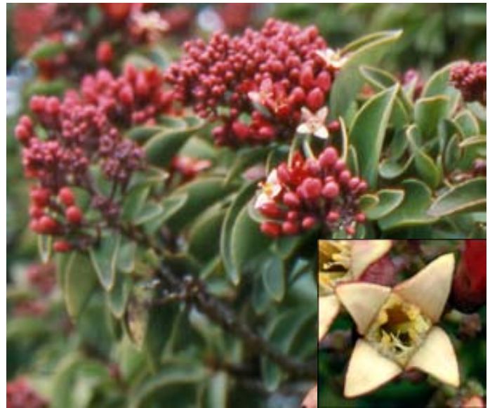
Santalum haleakalae.