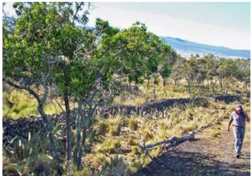
Top: Santalum ellipticum is unique in its adaptation to coastal conditions, here in Makapu'u, O'ahu. Bottom: Santalum ellipticum growing in an upland area in Pu'uwa'awa'a, Hawai'i.