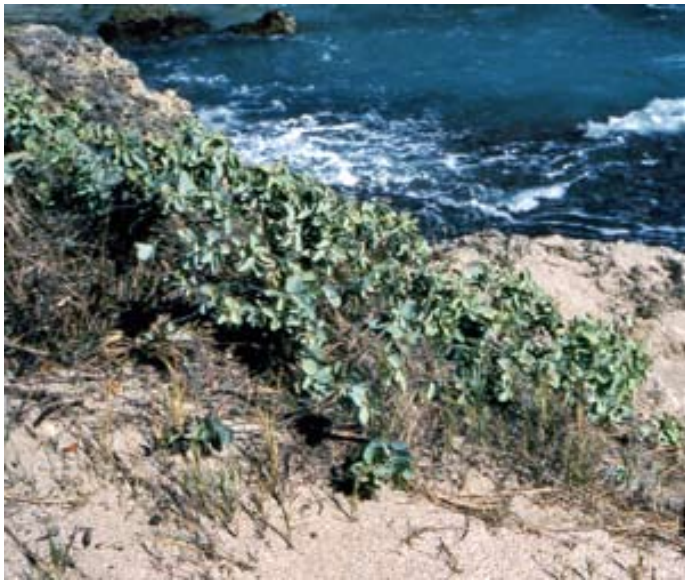
Santalum ellipticum along Wai'anae coast, O'ahu.