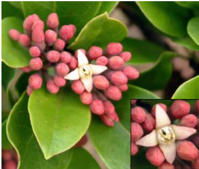
Santalum freycinetianum var. lanaiense.