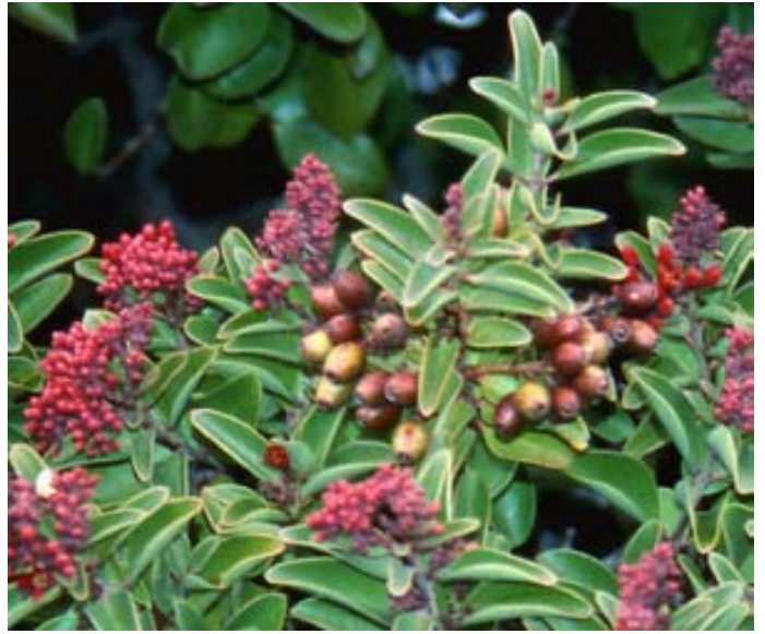
Santalum haleakalae .