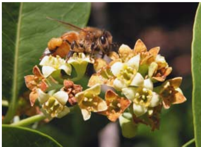
Bees and other pollinators frequent the abundant flowers. S. paniculatum , Kealakekua, Hawai'i.

Sandalwood trees are too slow growing and sensitive to environmental factors to be practical for these uses.