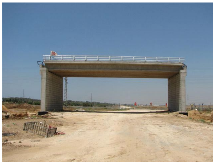
82.03 A road bridge to replace the level crossing south-east of Ashkelon; the road bed is that of the new line between Ashkelon and Beer-Sheva being built; photo-Aharon Gazit

"The first shipment of passenger cars manufactured by Siemens for Israel Railways - a mere six of the 86 ordered - finally arrived at Ashdod Port yesterday, though the German company had been supposed to start shipping the carriages beginning in December 2007. However, it will probably be another two or three months before passengers are able to enjoy their new ride, as additional assembly and running-in are required. According to the terms of the NIS 700 Million tender awarded to Siemens back in January 2006, the company was obligated to supply 86 cars starting in December 2007, with an option to pro-