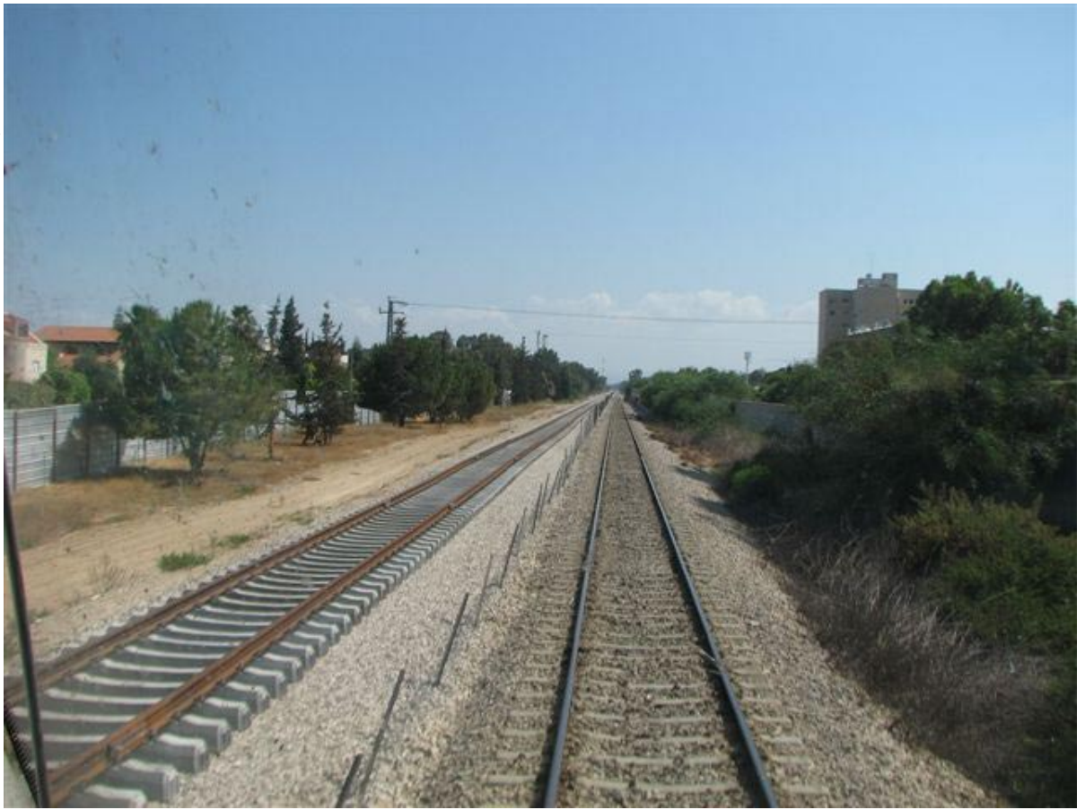
Below: (82:11a) further views on the Jerusalem line