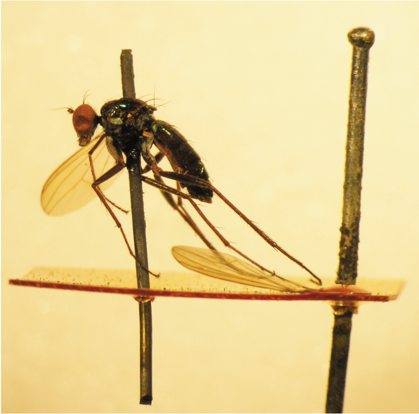
Fig. 1. Lectotype male of Paraliancalus metallicus (Grimshaw) in BMNH, lateral view showing how it is mounted and pinned.

Liancalus species include modification of the male wing apex (falcate tips, spots, etc.), an elongate filiform male cercus, and 3–4 pairs of scutellar setae.