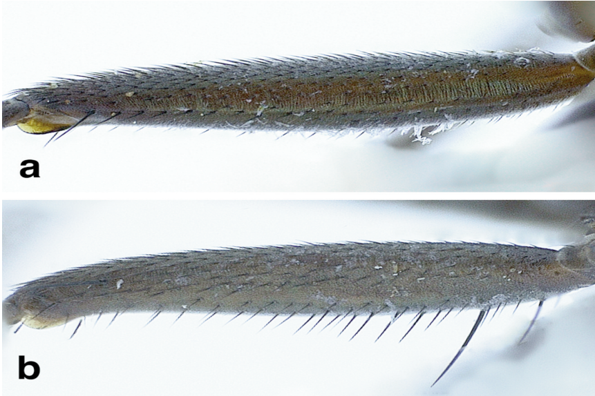
Fig. 4. Paraliancalus , male mid femora; a. P. metallicus (Grimshaw); b. P. lacinafemur , n. sp.

Females of Paraliancalus are difficult to differentiate, and female specimens from islands other than Maui are likely to be P. metallicus .