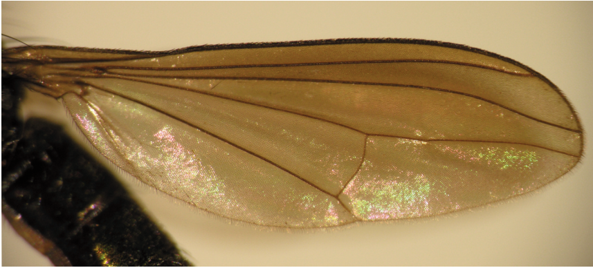
Fig. 2. Paraliancalus metallicus (Grimshaw), wing.