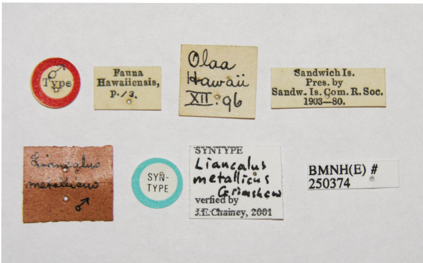
Fig. 3. Type labels for Paraliancalus metallicus (Grimshaw) in BMNH.

postvertical seta strong and positioned on dorsal postcranial slope; oc black, about two-thirds length of antennal arista, short weak vertical present laterad of ocellar seta; eyes separated below antennae by slightly less than width of antennal sockets, and face slightly tapering in width to clypeus; eye facets uniform; palp dark brown; proboscis brown, extending below eye in lateral view; antennal segments brown; scape ca 2 x width, sub-cylindrical; pedicel flattened; postpedicel short, length subequal to width; arista dorsal, slightly less than head height.