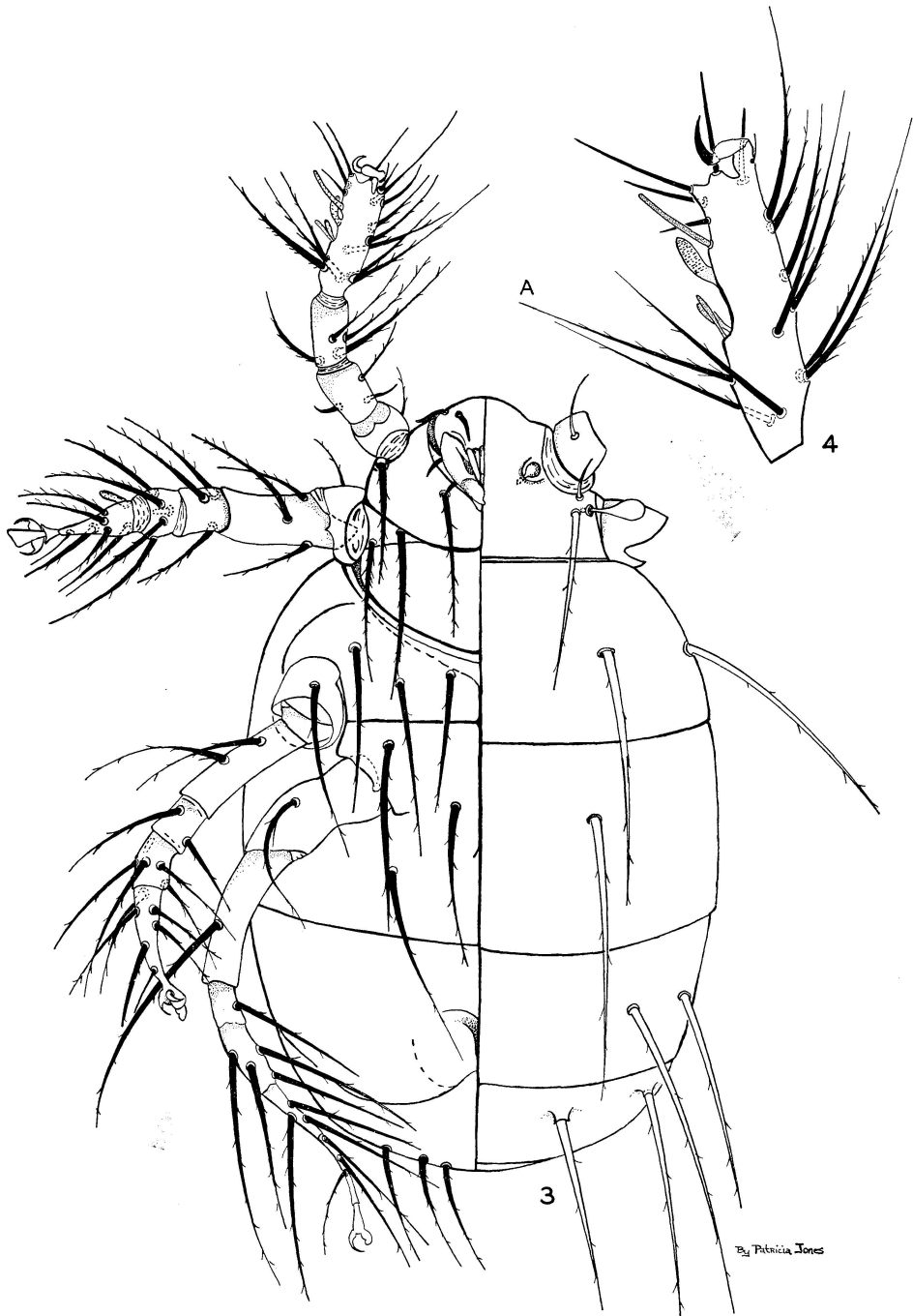
Fig. 3. Bakerdania equisetosa , n. sp., holotype ♀, dorsal and ventral. Fig. 4. Same, left tibia-tarsus I, paratype 1, dorsal aspect.