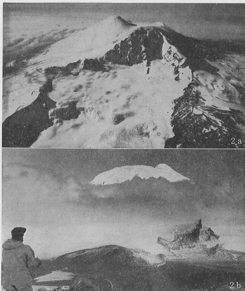
Fig. 2. a, Air view of Big Ben, Heard I., from S, ex Walrus aircraft, 1947 (P. Swan, ANARE photo); b, Mawson Peak, Big Ben, from Atlas Cove, 1953, (J. Béchervaise, ANARE photo).

cite, rich in Globigerina . Mt. Andrée is of trachyte. The McDonald Is. are also clearly of volcanic origin though no party has ever landed to determine their exact nature.