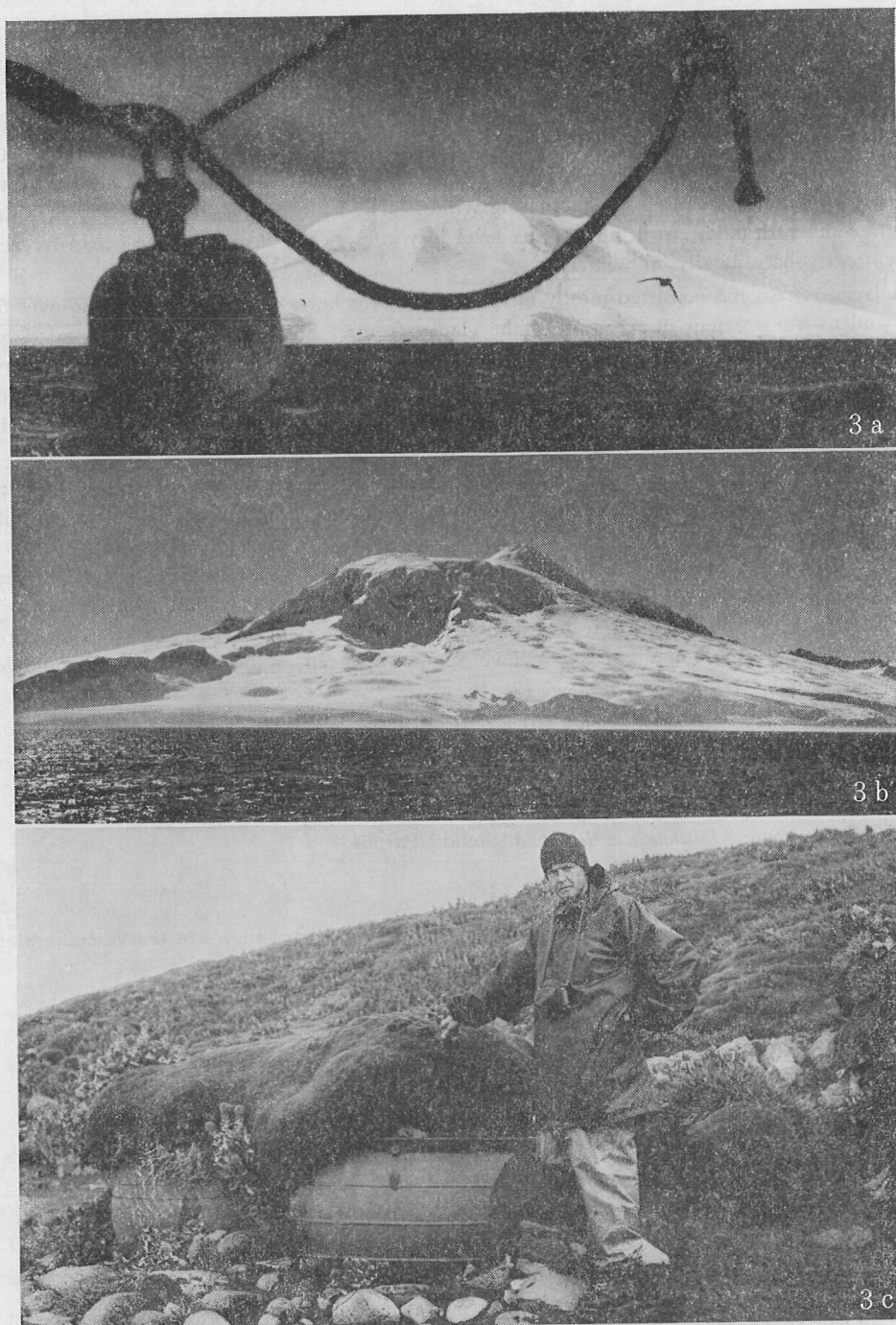
Fig. 3. a, Heard I. from "Patanela", Jan. 1965 b, Mawson Peak and South Barrier (right) from the west ; c, American sealers' trypots at Fairchild Beach, overgrown with Azorella, 1965