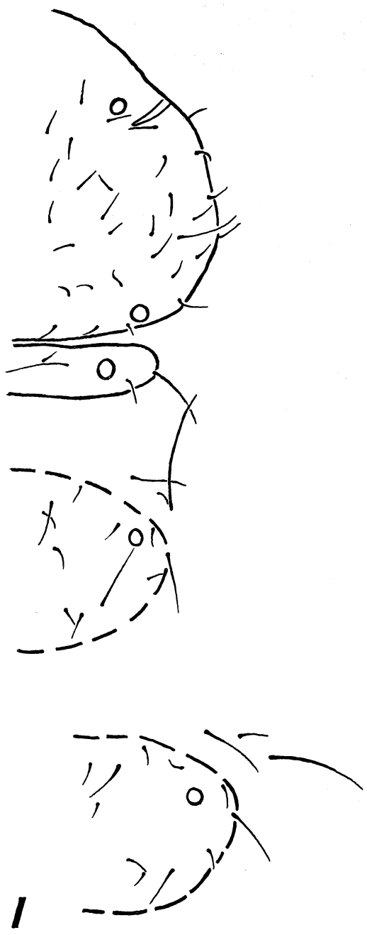
Fig. 1. Tullbergia templei n. sp. Head and thorax, setation and pseudocelli, (Holotype).