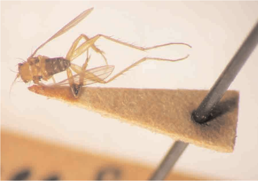
Figure 3. Lectotype male of Campsicnemus membranilobus showing tenuous condition of attachment of specimen to paper point.

Status: Lectotype male here designated in BPBM (BPBM No. 4061). The lectotype is pinned with a minuten to a cork point and carries the following labels: “Olympus / OAHU / Nov. 1, 1936 / FXW [Williams’s handwriting]”, “Campsicnemus / miser / Type / O. Parent [Parent’s handwriting]”.