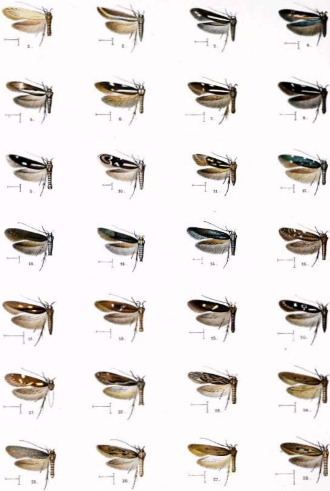
FW Frohawk del. A. J. Weale lith.