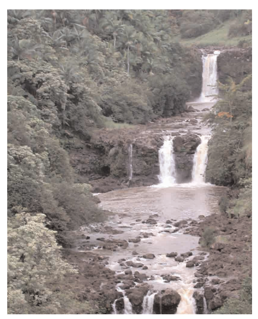
Figure 1. Midreach of Umauma Stream, Island of Hawai'i, demonstrating an example of "Aa" topography.

either into the ocean or onto a narrow rocky beach (Fig. 2). On the relatively older islands such as O'ahu and Kaua'i, larger stream systems are more common than they are on the younger islands. Long, low gradient terminal reaches exist upstream of sinuous mixohaline estuaries (Nishimoto & Kuamo'o 1991), above which can exist long midreach areas dominated by Type Bc and Type Bb reaches which grade into type Ab reaches farther inland. Type Aa reaches are encountered in these "terminal estuary streams" in upper midreach and headwater areas which can be several kilometers inland from the mouth of the stream (Fig. 3).