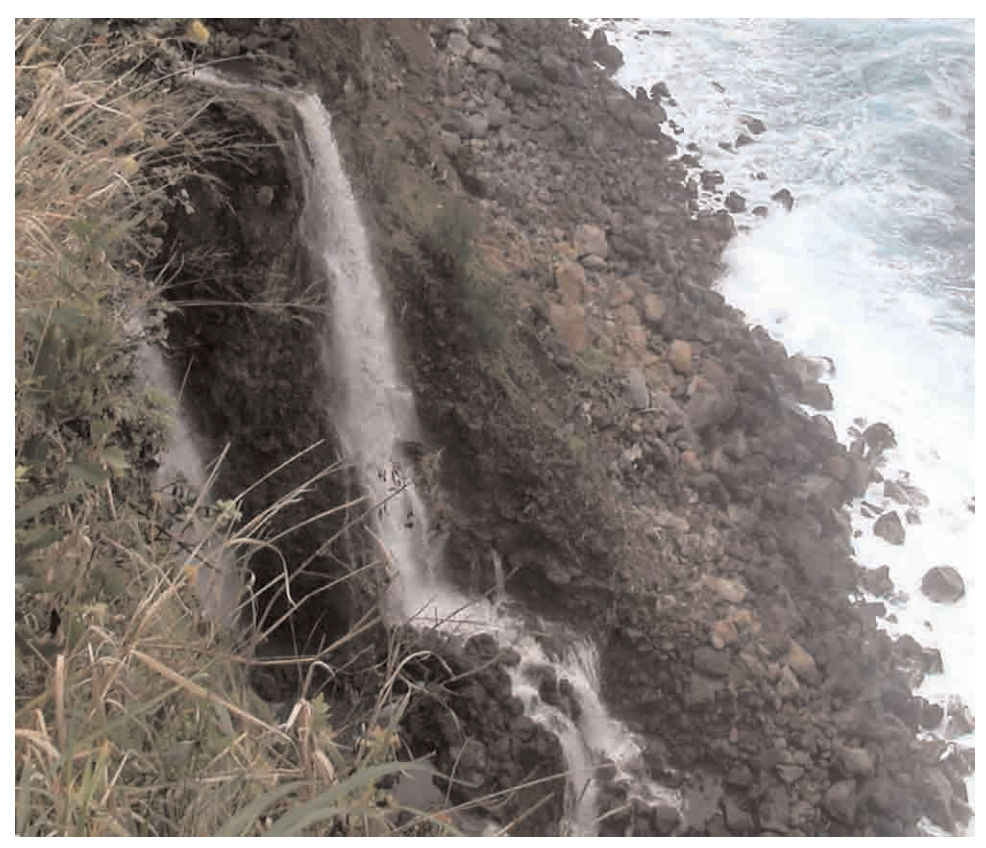
Figure 2. Terminal waterfall at the mouth of Manoloa Stream on the Island of Hawai'i.

faces associated with waterfalls when they are post-larvae and juveniles by using pelvic fins which are fused to form a suction disk. Eleotris sandwicensis lacks fused pelvic fins while S. hawaiiensis has fused pelvic fins, but lacks the associated musculature necessary for climbing waterfalls (Nishimoto & Kuamo'o, 1997). Both species, therefore, are precluded from dispersing upstream of any precipitous waterfall and are restricted in their distributions to terminal reaches and terminal estuaries. Awaous guamensis and S. stimpsoni can climb and disperse beyond moderately high waterfalls (less than ~20 m) and are found in Type Bc, Bb, and Aa midreaches up to an elevation of approximately 150 m (Fitzsimons & Nishimoto, 1990). Vertical waterfall height does not appear to be a limiting factor for L. concolor as they migrate upstream. Lentipes concolor has been sighted at elevations higher than 1 km (Fitzsimons & Nishimoto, 1990) and in stream reaches that were located above a waterfall with a more than 300 m vertical height (Englund & Filbert, 1997; personal observation).