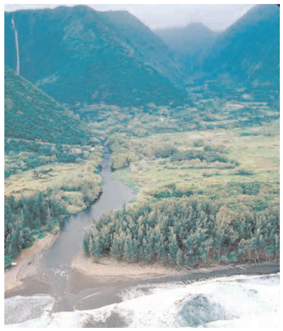
Figure 3. Example of a terminal estuary stream. Wailoa Stream, Waipi'o Valley, Island of Hawai'i.

(Nishimoto & Kuamo'o, 1991; Kinzie, 1988; Kido et al. , 2002). Similar waterfall-delineated instream distribution patterns have been described for assemblages of amphidromous gobies in Micronesia (Parham, 1995; Nelson et al. , 1997).