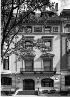
7 East 76th Street