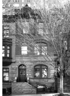
134 Manhattan Avenue