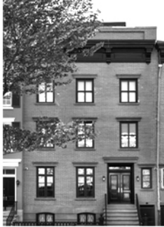
336 West 12th Street