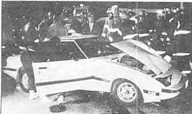
At left, 1981 Mazda driven by a Levittown resident on Jerusalem Avenue collided with a 1985 Plymouth Voyager (at right) driven by a Hicksville man who was killed Thursday night.

Fourth Fatal Accident on Jerusalem in '89