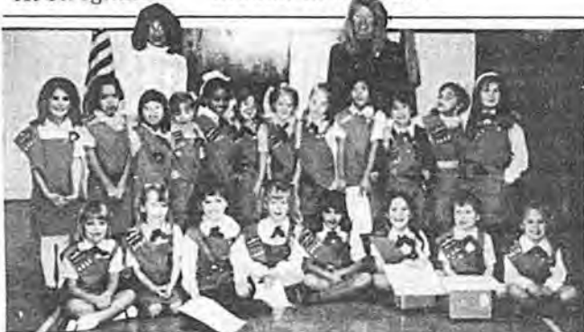
Saint Ignatius Brownie Troop 3682 with their leaders.