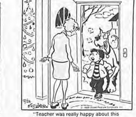
"Teacher was really happy about this being Christmas vacation. She kissed Marmaduke goodbye!"