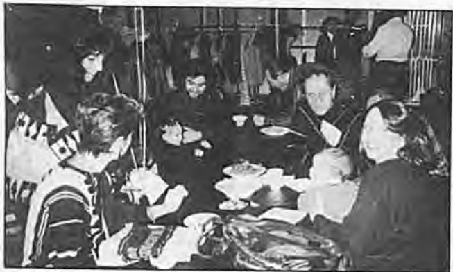
Some of the more than 100 adults and children who attended the Christmas party.