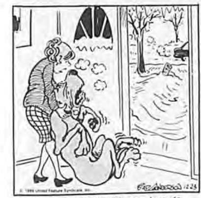
"You big baby! All I did was ask you to fetch the paper."