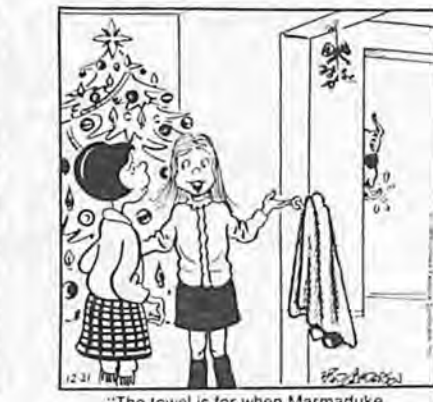
"The towel is for when Marmaduke catches you under the mistletoe."