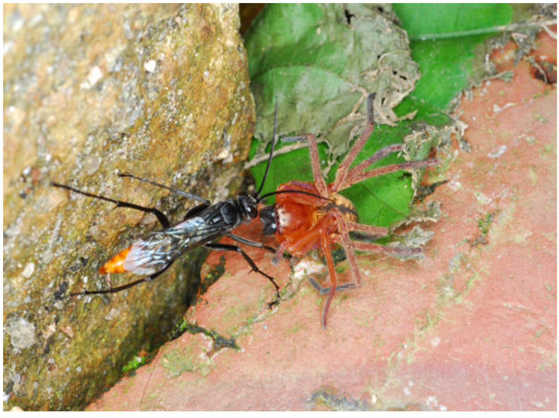
Figure 1 (left). T. analis dragging a paralysed Sparassidae, Olios sp..