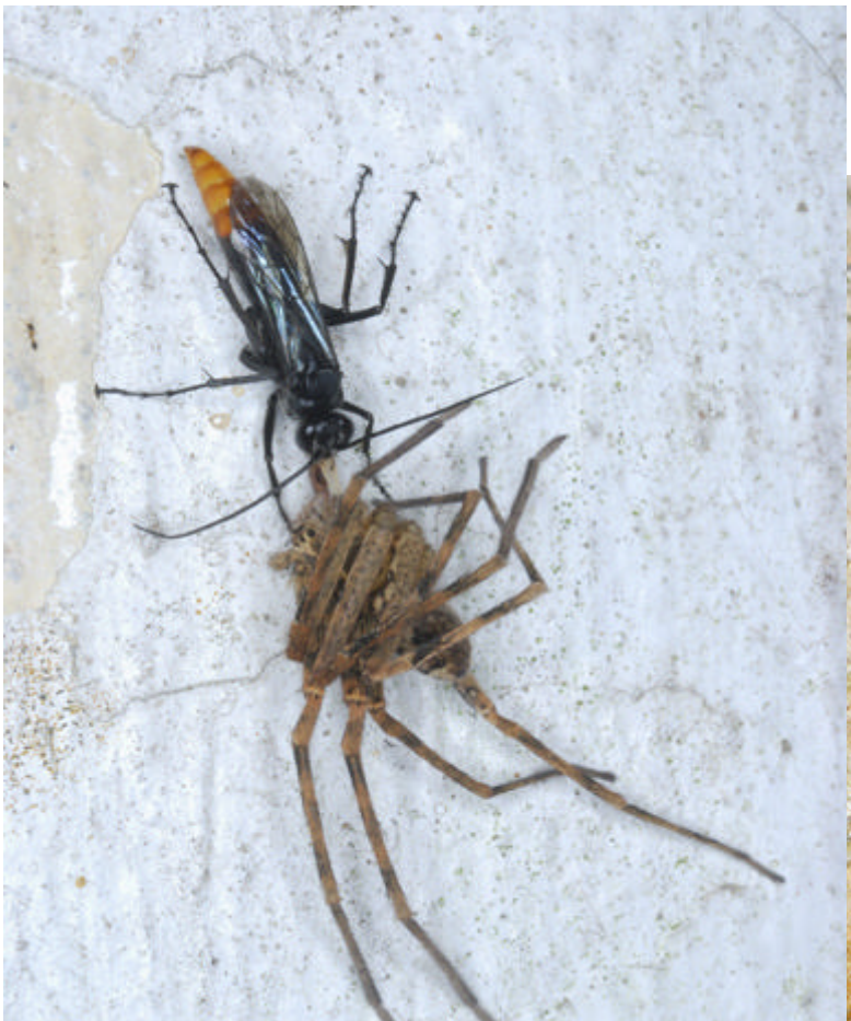
Figure 2 (below). T. analis dragging a paralysed Heteropodidae up a wall. (Photo author).

Figure 3 (below). A violent fight between two individuals of T. analis , the consequence of a prey theft attempt (Photo author).