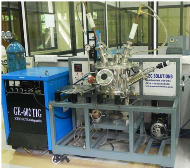
Fig. 1: Arc Melting Unit

Features: The metals can be heated to a temperature in excess of 2000°C. A batch of five alloys can be made in a single evacuation, as there are five crucibles in the hearth (four small and one large). About 15g of metals can be melted in the small crucibles and about 80g in the larger crucible. There are three main parts to the system: power source (TIG– 600Amp), chiller and vacuum unit. The vacuum unit with rotary and diffusion pumps can attain a vacuum of 10^{-6} m bar. The cold circulation water from the chiller cools both the copper hearth and the electrodes. After elemental metals (or master alloy) are melted and solidified, it can be 'turned over' by a 'tweezer mechanism' without breaking the vacuum (and then re-melted). The melting → solidification → 'turn over' of sample → re-melting process is typically repeated three times to attain a better compositional homogeneity. Apart from the abovementioned hearth with five crucibles, an additional hearth has been provided with one crucible, which can suction cast the molten alloy, in the form of thin cylinders (typically 3mm diameter).