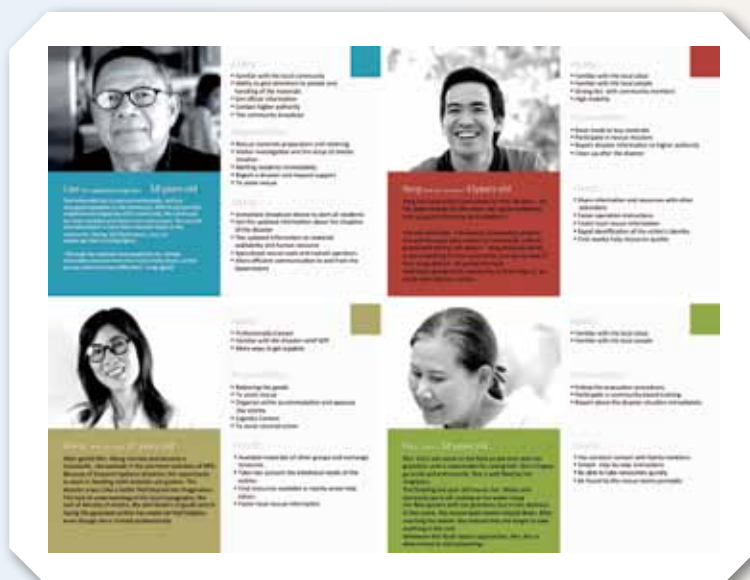
▲ iNSIGHT's user profiles

First of all, through its user experience research, the center aims to discern the types of energy users and their behavioral traits so as to formulate energy user profiles. The establishment of the user profiles will help government policymakers gain a better understanding of the focus and directions of