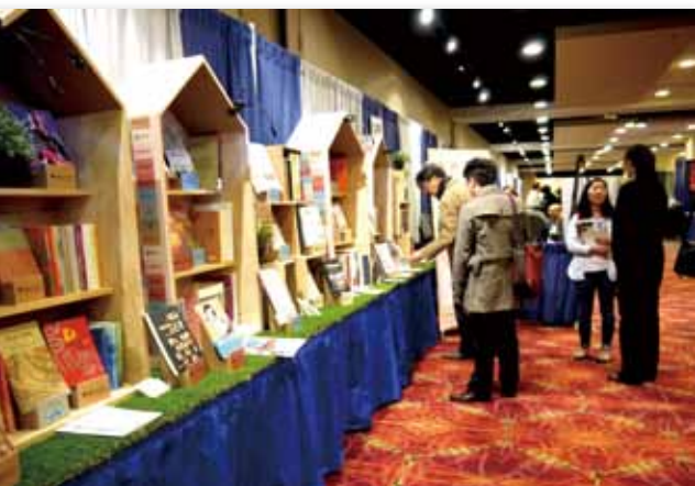
▲ Scholars attending AAS's 2014 Annual Conference peruse books displayed by NTU Press and National Taiwan Normal University Press.

National Taiwan University Press led seven Taiwanese national university publishers in holding a joint book exhibition during the Association for Asian Studies 2014 Annual Conference in Philadelphia during March 28–30. Building on the momentum they accumulated through their joint exhibition at the 2014 Taipei International Book Exhibition in February, the seven university publishers organized the joint exhibition in order to go international and share their outstanding academic publications with a global audience. The AAS exhibition was the first joint book exhibition these university publishers have organized overseas.