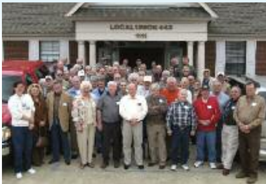
Local 443 retirees, spouses and guests gather at the hall for the retirees luncheon.