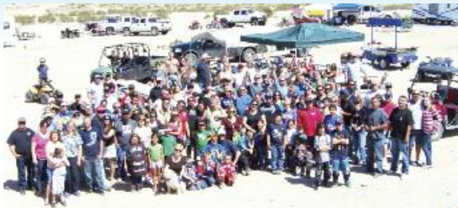
IBEW Local 47 members and their families attend the 4th Annual Desert Days in Stoddard Wells.