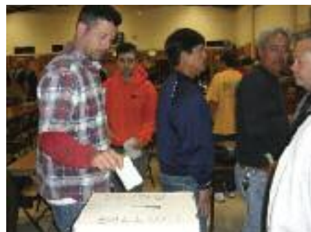
Local 595 members vote to ratify new contract extension at special-call meeting.