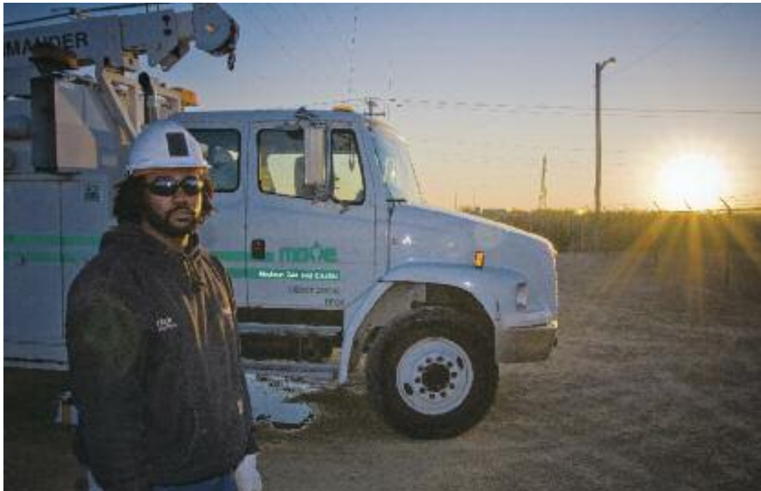
Fourteen linemen were hired above predicted staffing levels at Madison (Wis.) Gas and Electric after Local 2304 pushed for work force planning to be part of the utility's required energy assessments.

Utility local leaders and members who are sick of too much talk and too little action on the glaring need to replace hundreds of thousands of retiring workers now have a potent new tool to grab the attention of employers and public officials.