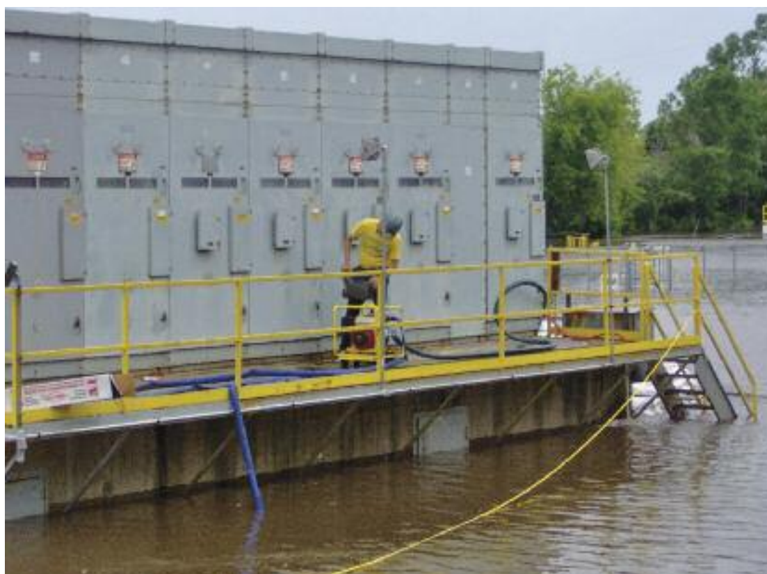
A Cargill employee pumps water out of a high voltage switchgear at the Cargill corn processing plant following massive flooding in 2008. More than 250 IBEW members worked to revive the plant.

Hundreds of local members were joined by 800 travelers to resurrect Cedar Rapids’ industrial plants—including Quaker Oats and agriculture giant Cargill—and re-energize the city’s only salvageable 225-megawatt power plant. It was dirty, dangerous work. Floodwaters were rife with chemicals and bacteria, and underground wire in nearly