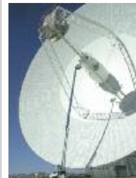
Scheduled maintenance for NASA's 70-meter antenna is performed by IBEW Local 543 members.

L.U. 543 (mo&t), SAN BERNARDINO, CA—Local 543 members perform scheduled maintenance on NASA's Deep Space Network 70-meter antenna while working from an aerial lift. The 70-meter antenna has been shut down for a period of six months so that the hydrostatic and elevation