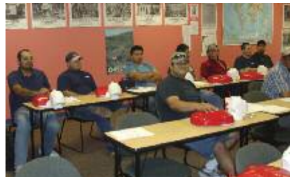
Local 1015 members attend a CPR/First Aid class.