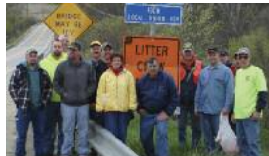
Local 459 highway cleanup crew volunteers.