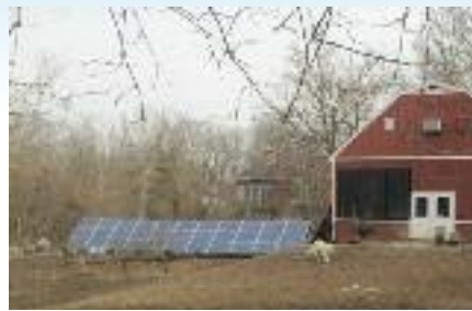
Solar Panels "hatched" by Springfield, IL, Local 193 contractor Lewis Electric Inc. at the Ostrich Farm site.

The work scene is slow, but Scheels Sporting Goods is to break ground at the new MacArthur Extension soon. The construction project is a 200,000 square foot building. Please check out our Web site at www.ibew193.com .