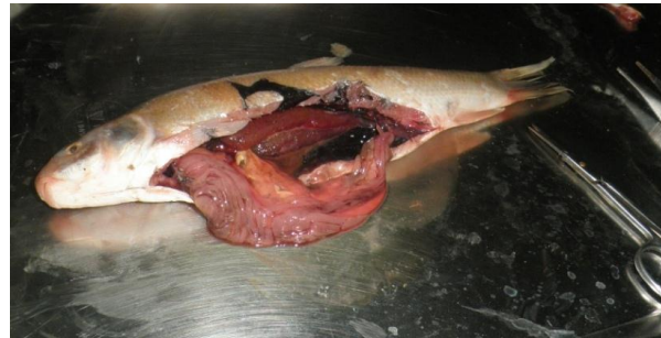
Fig. 3 Dissection of examined fish, Capoeta barroisi

The methods and techniques used for collection, relaxation, fixation, staining and mounting of helminthes are basically those described by Hanek and Fernando (1972) and Roberts (2001).