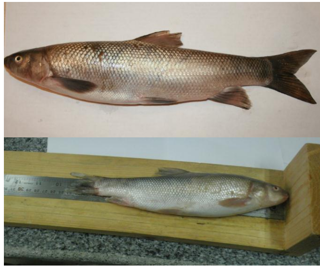
Figure 2 Capoeta barroisi

identification key. The standard length and weight of each fish was measured to the nearest millimeter and milligram, the sex was determined internally (Fig. 2).