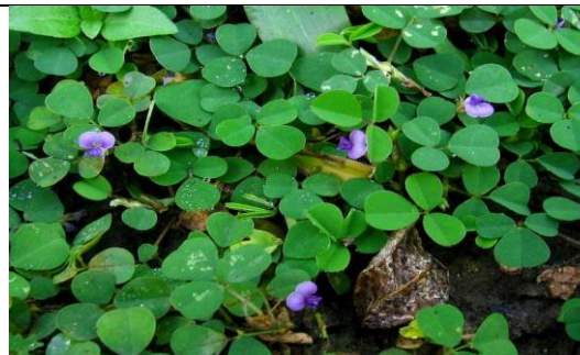
Figure 2. Desmodium triflorum