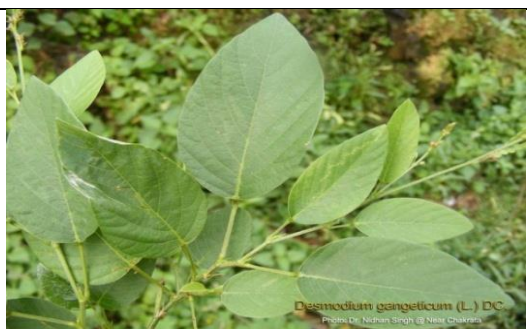
Figure 5. Desmodium gangeticum