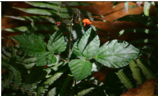
Figure 1. Desmodium repandum