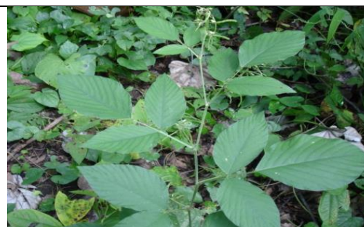
Figure 6. Desmodium laxiflorum

D. podocarpum : Hylodesmum podocarpum (synonym) is the herbaceous perennial plant with erect stems 50 – 110 cm tall. The whole plant and bark of the root is used for fever and curing malaria. Panchangas are used medicinally for treating dysentery, and rheumatism 15 (subspecies fallax ). The