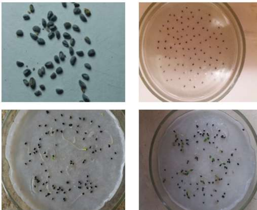
Figure 2. Germination of Scutellaria adenostegia seeds

Seed germination capacity was 20 0 -30 0 14%. The dormancy period of Scutellaria adenostegia seeds was short, the germination of seeds obtained at the end of September 2018 was 65%, after one year of storage it decreased sharply to 17.6%, and two years later to 2.4%. Therefore, it is recommended to use freshly harvested seeds in the organization of artificial plantations of S. adenostegia [6].