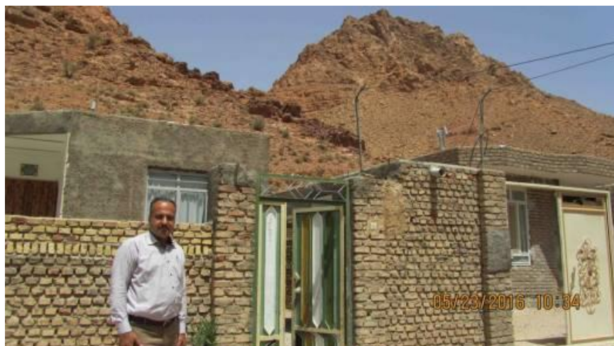
Figures 48 & 49 & 50 & 51 & 52 & 53 & 54 & 55 & 56: author presence in pastures and ranges of Ferula assa Foetida (major weak) with herds of sheep and goats (specially). Mavdar and Sorond villages of Tabas City, 300 km. distance to Birjand, centre of South Khorasan province (May 23, 2016).