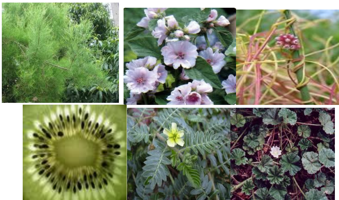
Figures 57 - 87: some endemic medicinal plants during scientific tour & field trip of author in Ferula assa Foetida with research team from Botanical Garden belonged to ministries of education and science of the Republic of Kazakhstan in visiting from historical market of Birjand and its traditional shops of medicinal plants plus visiting pastures, mountains and gardens around Mavdar and Sorond villages of Tabas City, 300 km. distance to Birjand, centre of South Khorasan province (May 22 & 23, 2016) (Golmohammadi, 2016) & Achieve (Information and Statistical Department, 2016).