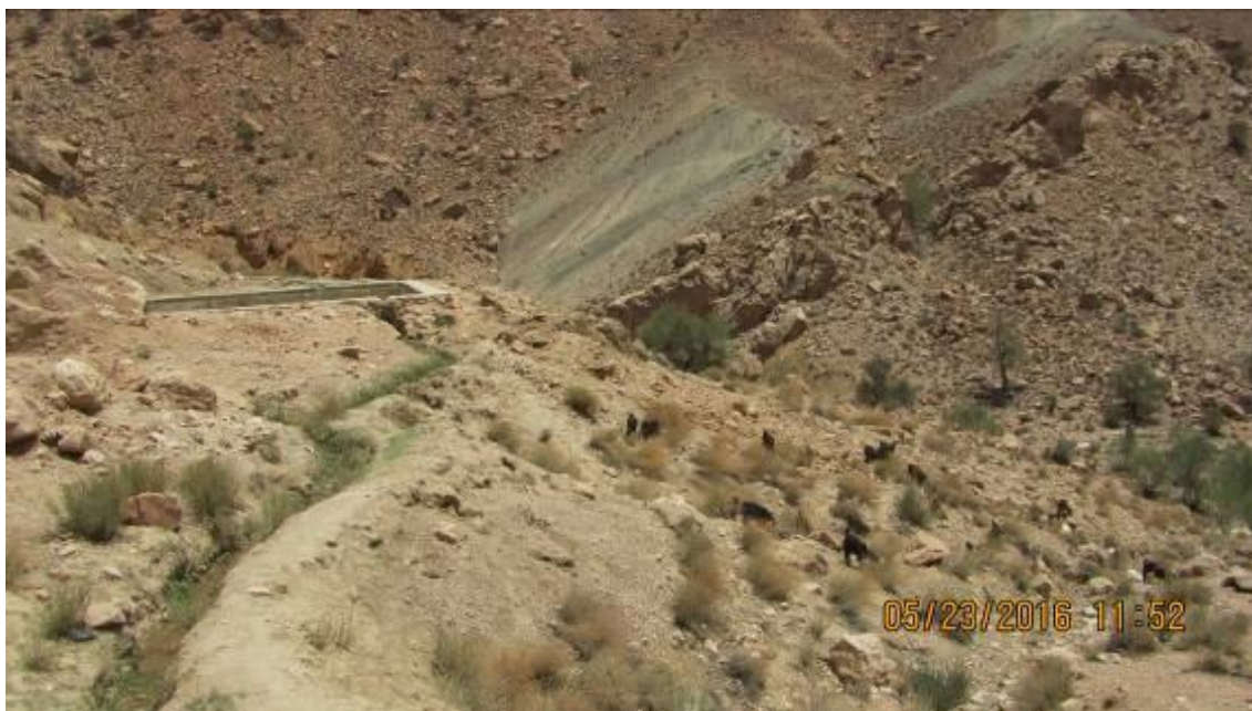
Figures 1 & 2 & 3 & 4 & 5 & 6: author presence among medicinal plant collectors that are usually poor villagers and plant collection is their part time activity besides farming and herds keeping. Mavdar and Sorond villages of Tabas City, 300 km. distance to Birjand, centre of South Khorasan province (May 23, 2016).