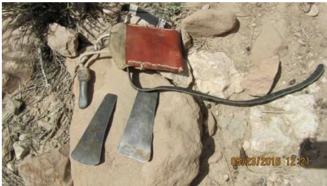
Figures 23 & 24 & 25: traditional tools of villagers for doing various stages in preparing shrubs of Ferula assa and cutting its stem for harvesting and catching its medicinal gum. Mavdar and Sorond villages of Tabas City, 300 km distance to Birjand, centre of South Khorasan province (May 23, 2016).