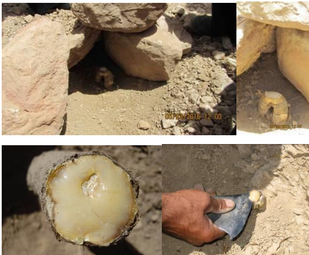
Figures 15 & 16 & 17 & 18 & 19 & 20 & 21 & 22: villagers that do various stages in preparing shrubs of Ferula assa and cutting its stem for harvesting and catching its medicinal gum (Shireh). Mavdar and Sorond villages of Tabas City, 300 km. distance to Birjand, centre of South Khorasan province (May 23, 2016 & 2013).