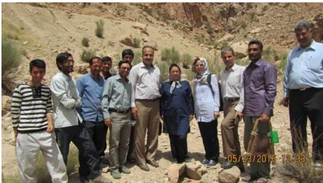
Figures 38 & 39 & 40 & 41 & 42 & 43 & 44 & 45 & 46 & 47: scientific tour & field trip of author in medical plant of Ferula assa Foetida with research team from Botanical Garden belonged to ministries of education and science of the Republic of Kazakhstan in visiting from historical market of Birjand and its traditional shops of medicinal plants plus visiting pastures and mountains around Mavdar and Sorond villages of Tabas City, 300 km. distance to Birjand, centre of South Khorasan province (May 22 & 23, 2016) (Golmohammadi, 2016).