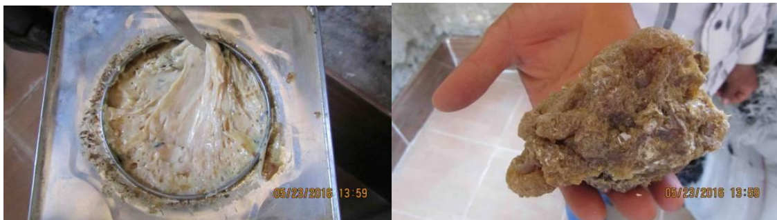
Figures 36 & 37: Essential medicinal oil – oleo gum resin (OGR) - of Ferula assa-foetida (Shireh- in endemic Persian language) in jelly (first) and solid (final) formats. obtained from pastures of Mavdar and Sorond villages of Tabas City, 300 km. distance to Birjand, centre of South Khorasan province (May 23, 2016).

Oleo-gum resin is obtained as secretions of the upper parts of the roots of the plants by incision. It is dark brown to black resin-like gum obtained from the juice of the rhizome. After drying, it becomes darker brown, resin-like mass. Different grades of resins, dried granules, chunks, or powders are sold. It is marketed in three forms-tears, mass, and paste (figures 36 & 37).