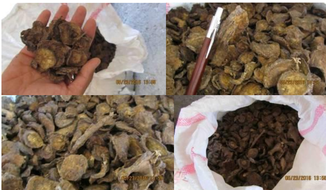
Figures 32 & 33 & 34 & 35: final production of dried thin cutting stems of Ferula assa (Keshteh- in endemic Persian language) for supplying to market and processing by medicinal factories. Mavdar and Sorond villages of Tabas City, 300 km. distance to Birjand, centre of South Khorasan province (May 23, 2016).