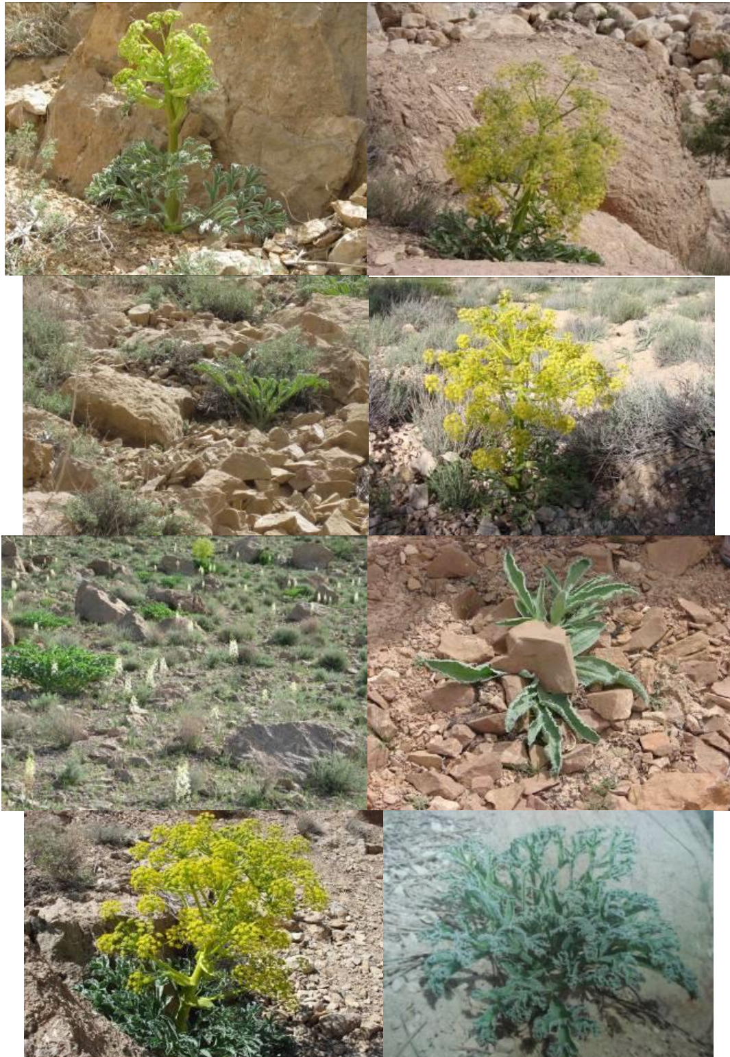
Figures 7& 8 & 9 & 10 & 11& 12 & 13 & 14: Shrubs of Ferula assa Foetida in mountains and pasturelands of south Khorasan province in different stages of their growing.

2.various stages for harvesting Ferula gum, plus producing and sowing its seeds