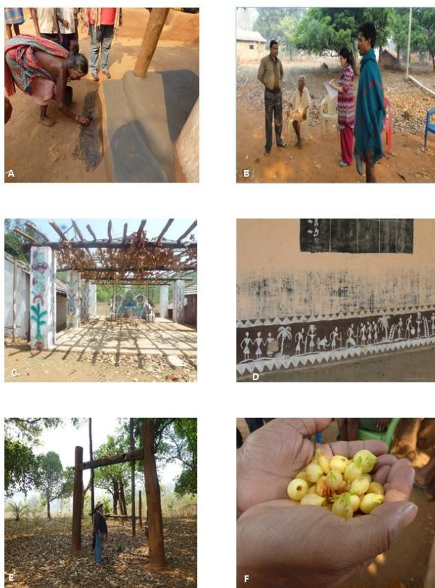
A- Bandabhuyan elder demonstrating process of traditional coating of grey mud and natural dye obtained from bark of Asan (Terminalia tomentosa) B- Author in conversation with villagers in Bandabhuyan C- Decorated and colourful entrance to village temple in Itee D- House walls decorated with traditional paintings E- Author observing the traditional swing in Rugudhi F- Mahula flowers (Madhuca longifolia) are used in Mahul puja observed in all villages

Based on evidence and results of this study we have arrived at interesting conclusions. Tribal societies are highly sensitive bio-cultural areas and they require a case by case attention for protection and conservation of their ethnic knowledge. Same geographical location does not necessarily mean that external influences on the tribes are uniform. Hence a 'one size fits all' model of development will be detrimental to the situated knowledge systems flourishing with these indigenous communities.