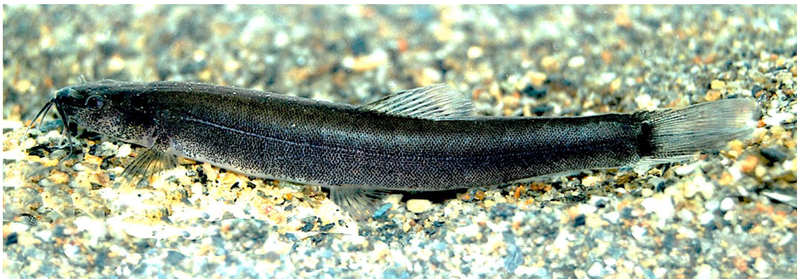
Figure 4. Nemacheilus nsp., MZB 21449, 42.7 mm SL; Sungai Batu Nyambil, Sei Samai drainage, Antakalang, Kotawaringin Barat, Kalimantan Tengah Province, Indonesia.

Throughout the field trips in Sunda Islands, three new Nemacheilus species have been described, and one more is waiting to be named. Considering that there are still many unexplored waters, it is very possible that there are more undescribed species of Nemacheilus in this area.