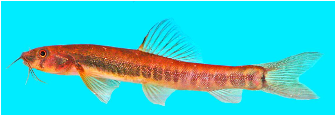
Figure 2. Nemacheilus tebo , MZB 13367, holotype, 56.1 mm SL; Lake Tebo, Sangkulirang karst area, Kalimantan Timur Province, Indonesia.

Sexual dimorphism. Male with suborbital flap and much more tubercles on flank than female. The flap is smaller in the largest specimen.