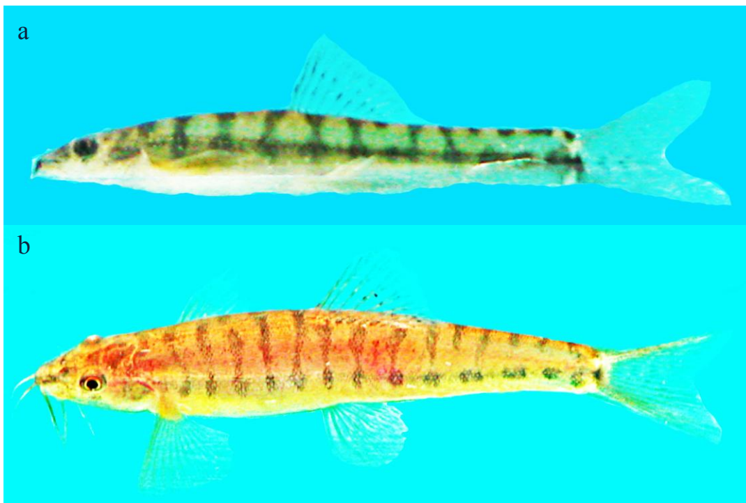
Figure 3. Nemacheilus marang : a. MZB 13301, holotype, 38.9 mm SL; b. MZB 13306, 55.9 mm SL, a gravid female, Marang River, Tepian Langsat, Sangkulirang karstic area, Kalimantan Timur Province, Indonesia.