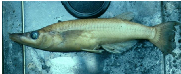
Figure 2. Adrianichthys poptae , adult female, 146 mm SL, Collected 1991 from Lake Poso by Adrian Sigilipu. Manado, Sulawesi, August, 1995.

Introduction of exotic species has been rampant in the tectonic lakes. The number of documented introduced species is staggering. Sixteen exotics were reported by Tantu & Nilawati (2007) from Lake Matano, including the guppy, Poecilia reticulata , the common carp, Cyprinus carpio , and Mozambique tilapia, Oreochromis mossambicus , three species widely introduced worldwide in freshwater habitats. These assaults on the endemic fish fauna have undoubtedly caused the extinction of several species in Sulawesi. The large ricefish or buntingi, genus Adrianichthys , endemic to Lake Poso, comprise four species, two of which, A. kruyti and A. roseni , have not been collected in decades (see materials in Parenti, 2008). A third species, A. oophorus , was abundant in 1995 (Parenti & Soeroto, 2004). An adult female Adrianichthys poptae measuring 146 mm Standard Length (SL) and 180 mm in total length, was collected on hook-and-line in April, 1991 by Adrian Sigilipu, a local schoolmaster (Figure 2; Soeroto & Tungku, 1991; B. Soeroto, pers. comm.). Published reports indicate that the species was collected as most recently as 2003 (Parenti & Soeroto, 2004). These A. poptae specimens are not known to have been deposited in museum collections, which means, unfortunately, that their identification and continued existence in Sulawesi cannot be confirmed.