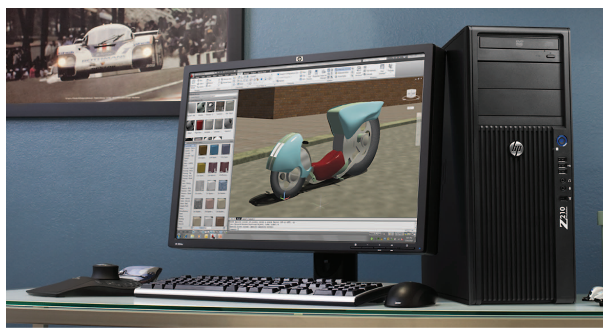
The HP Z210 Workstation is the ideal solution for AutoCAD users.