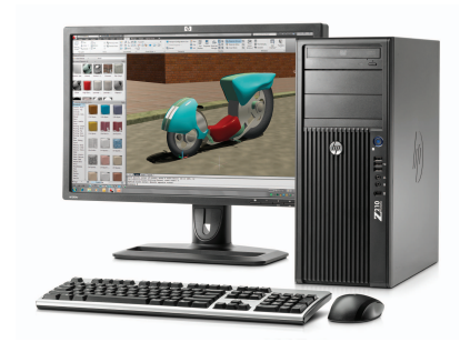
AutoCAD and AutoCAD Mechanical