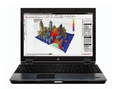
Mobility (for all Autodesk applications)