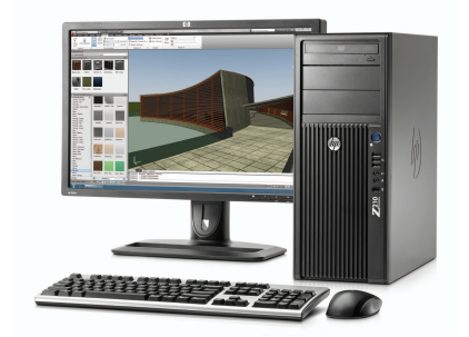
AutoCAD, AutoCAD Architecture, and other AutoCAD based applications