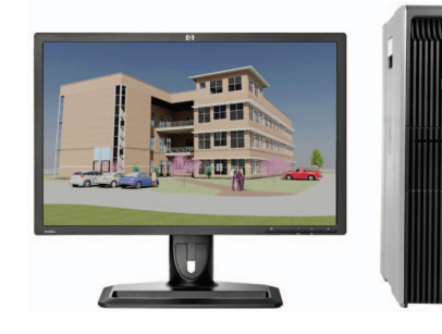
Autodesk Revit Architecture Revit Structure, Revit MEP