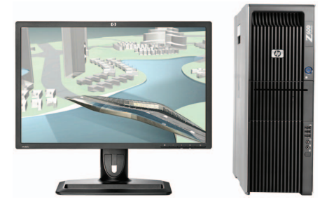
AutoCAD Civil 3D/AutoCAD Map 3D