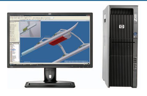
Autodesk Inventor Professional Suite or Autodesk Inventor Simulation Suite