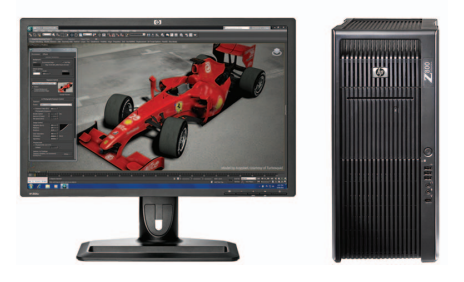
Autodesk Alias, Autodesk Showcase, Autodesk 3ds Max, Autodesk Simulation including Autodesk Moldflow products, Autodesk Maya