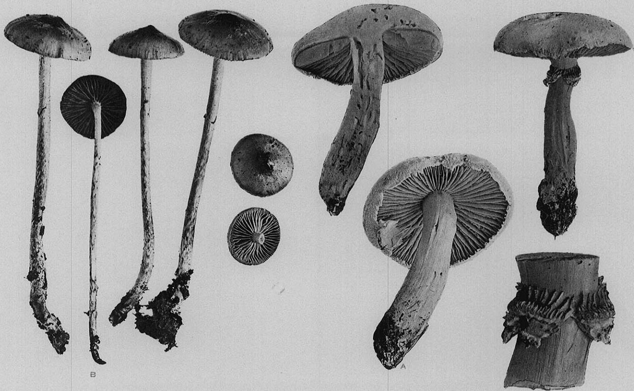
STROPHARIA UMBONATESCENS, PK.