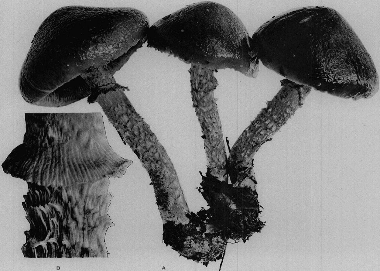
STROPHARIA DEPILATA (PERS.)