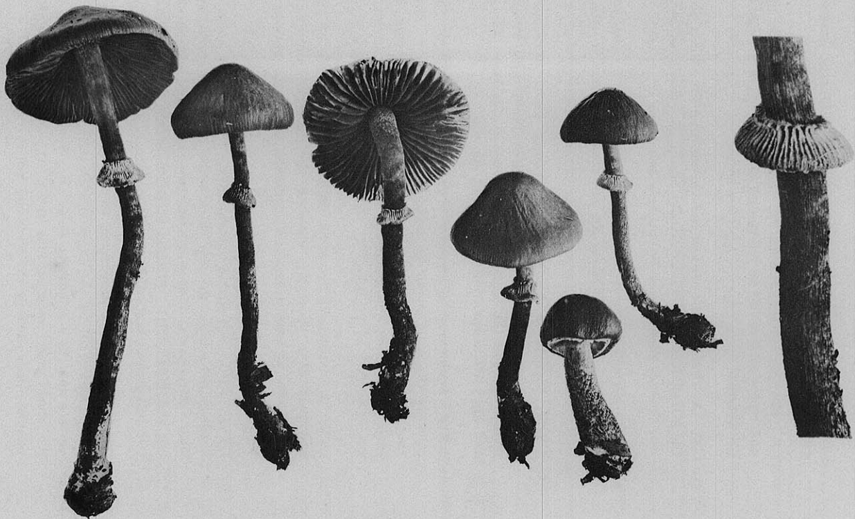
PHOLIOTA BLATTARIA, FR.