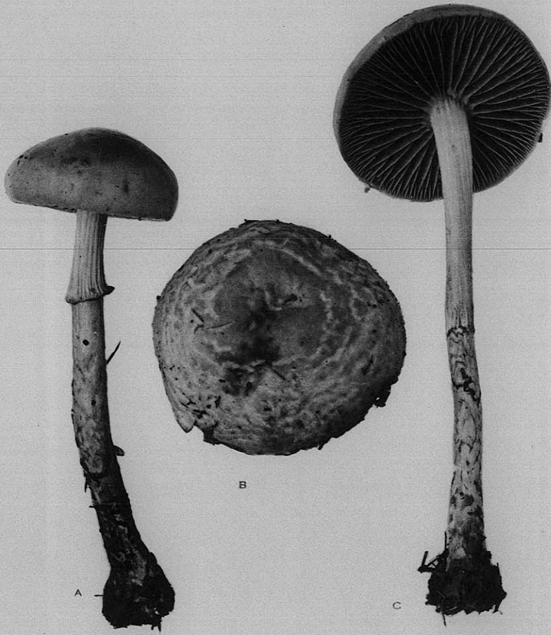
STROPHARIA STERCORARIA, FR.