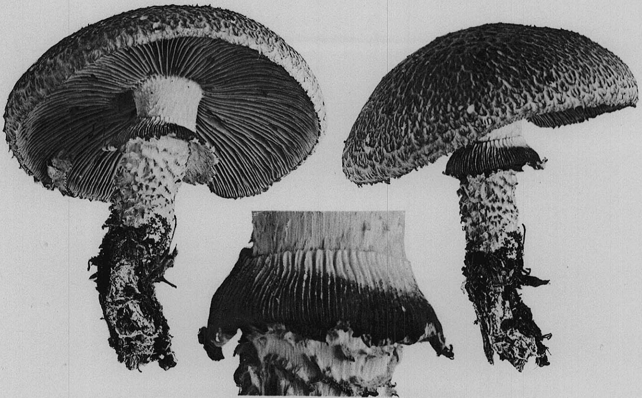
PHOLIOTA FULVA—SQUAMOSA, PK.