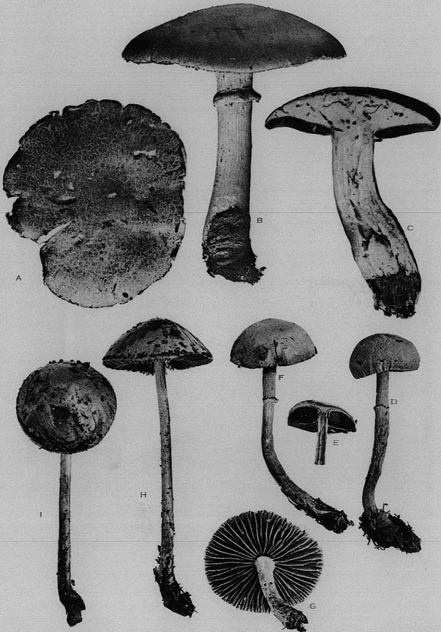
A. B. C. STROPHARIA OBTURATA FR. D. E. F. STROPHARIA SICCIPES. KARST G. H. I. STROPHARIA SUBMERDARIA BRITZ