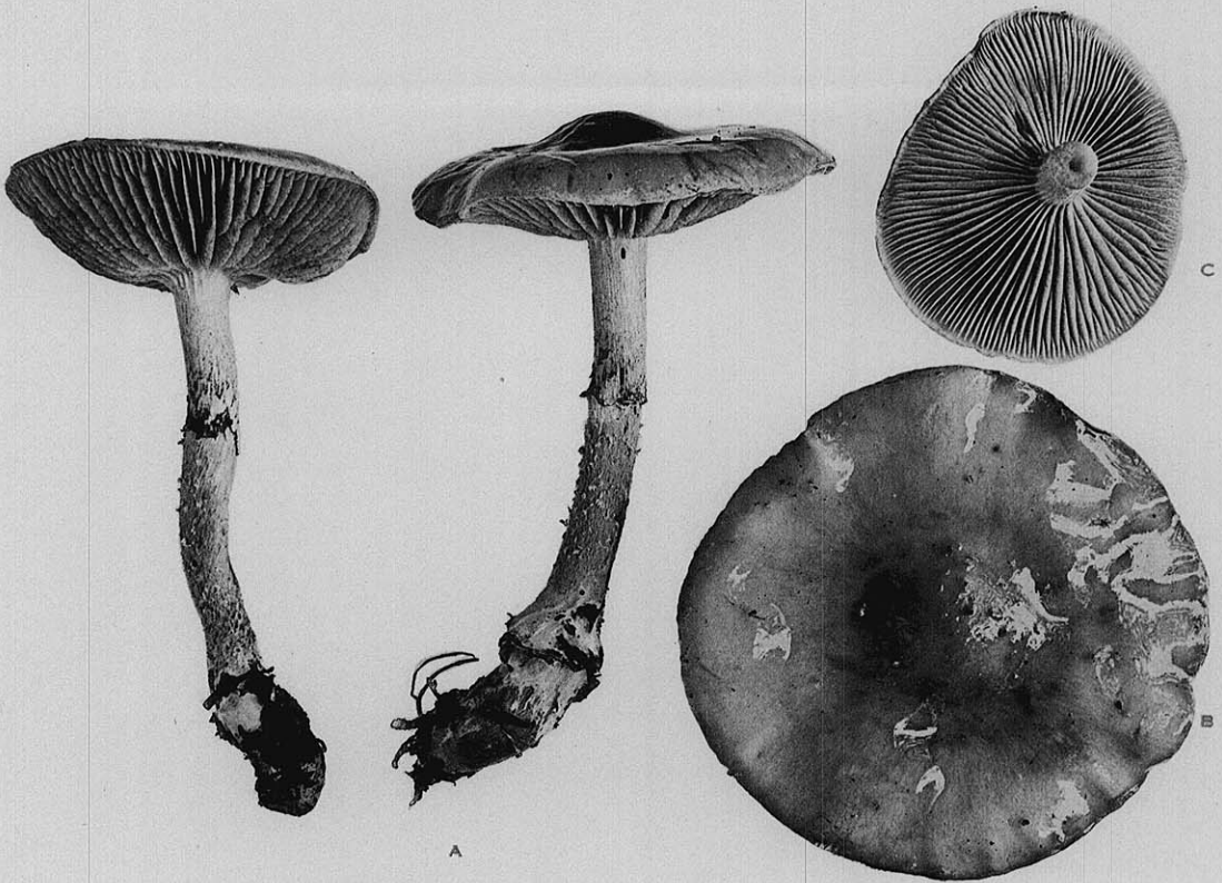
STROPHARIA AERUGINOSA (CURT.)