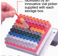
Working-figure (Vial 집게/Box & Stand)

Removal of vials facilitated by an innovative vial picker supplied with each storage box.