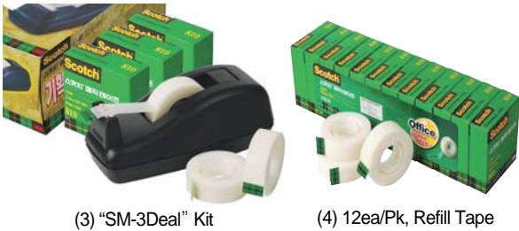
(3) “SM-3Deal” Kit