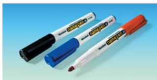
A18384 · A18385 · A18386 : 그림은 1.8mm Tip임.