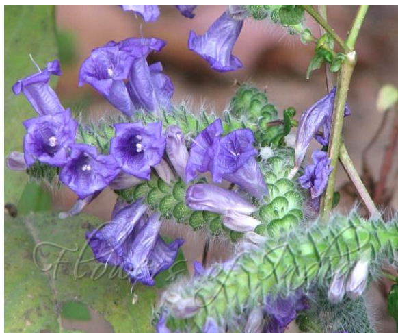
Fig.11: Strobilanthes auriculatus nees

trichomes, 4-seeded. Seeds ovate in outline, ca. 3 × 2 mm, with long trichomes; areola small 31 .