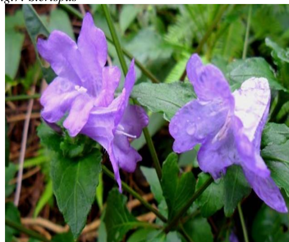
Fig.9: Strobilanthes cusia