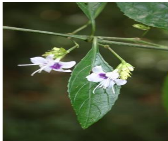
Fig. 2: Strobilanthes ciliates (Flowers)