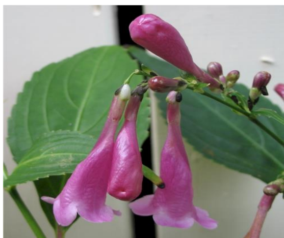
Fig.6: Strobilanthes hamiltonia

The leaves are oblong-lanceolate, rather obtuse and shallowly crenate crispate and have rough surface, covered