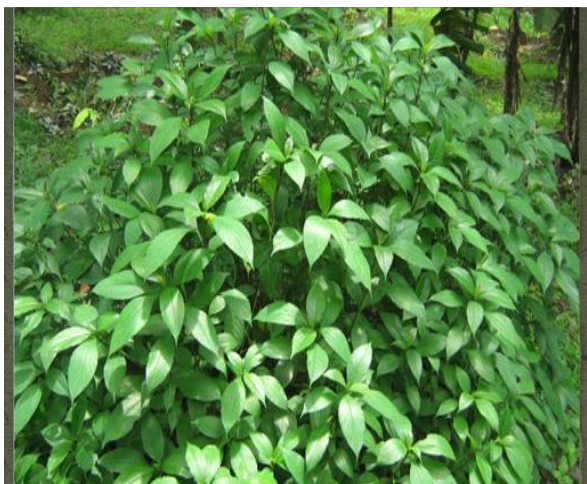
Fig. 1: Strobilanthes ciliates (whole plant)