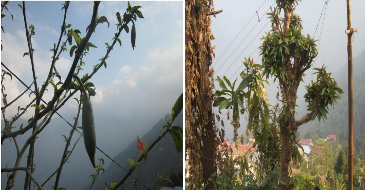
Figures 5-6: Fruit bearing Solanaceous Trumpet tree ( Brugmansia suaveolens Berchst. & J. Presl) at left and Gagun tree ( Saurauia napaulensis DC. ) as a fodder tree at the right.