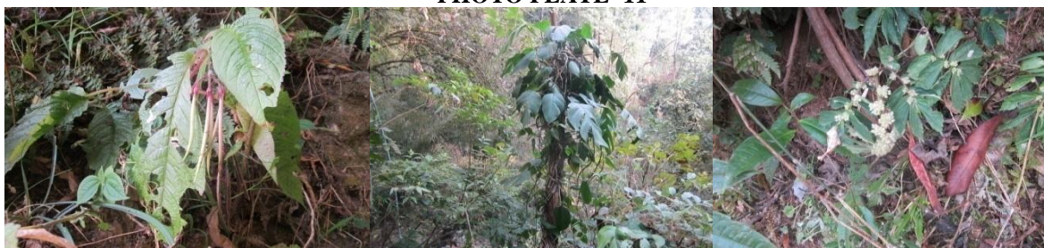
Figures 48-50: Didymocarpus aromaticus Wall. Ex D. Don of Gesneriaceae; Raphidophora decursiva (Roxb.) Schott of Araceae; and Elatostemma sessile Forester & Forester f. of Urticaceae