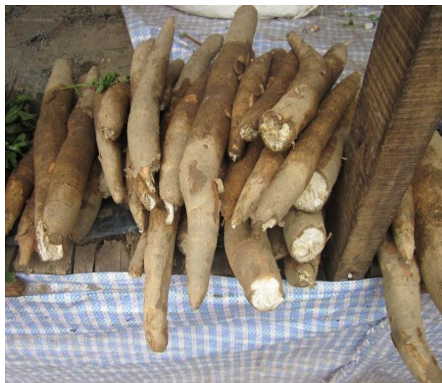
Figures 30-32 : 30. Orange-red coloured flowers–scape of Aloe sp. ( A. striata x maculata hybrid), White-Sukhdarsan; 31. Bhokatay fruit- Citrus grandis L. (Juice of fruits used for drinking purpose, very rich in Vitamin-C) and 32. Simal ( Manihot utilissima Pohl. of Euphorbiaceae). Note that, modified stems of different creepers are called “taru”.