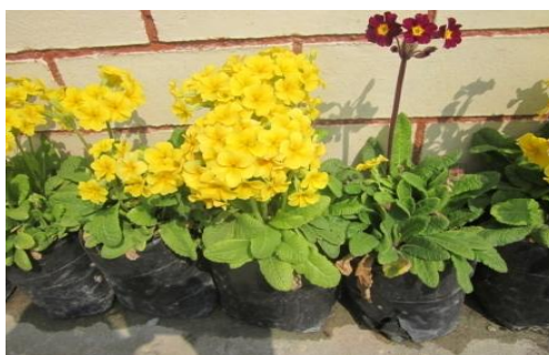
Figures 66-68: Wild Ginger ( Zingiber sp.) and fronds of fern ( Nephrolepis sp. –The bulb of underground one called Pani Amla used in Urinary troubles in Men/women ; Kalanchoe garden variety, Colorful Primula (Garden variety) planted in front of the small village house for the medicinal and aesthetic purpose.