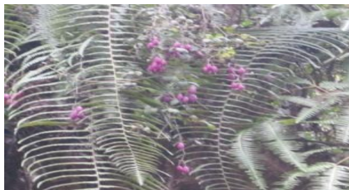
Figures 51-53 : Devimandir (Sacred Grove) at Golaigaon, Mailamama Sacred Grove at Mulgaon, Pink /majenda Fruits are fruits of Dicentra scandens (D. Don.) Walpers hanging over fern leaflets near jhora.(Waste water falls).