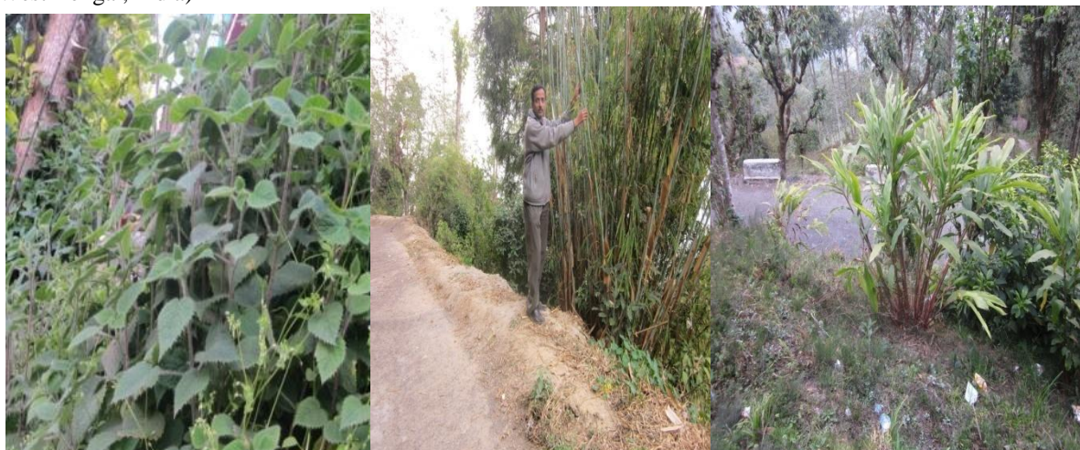
Figure 17 Mixed heterogeneous vegetation reaching Climax formation at jungle of Pandam from Udaygram, Darjeeling; red colored leaves indicating the plant like Oxyspora paniculata DC. with dried fruits, white flowers for Michelia sp. (Champ) and red for Rhododendron sp.(Lali Guras) flowers.

Figures 18-20: Gharia Sishnu (Gharia means near House) at the left, Mali Bamboo (middle) and Amomum subulatum (Baro Alaichi) at the right.