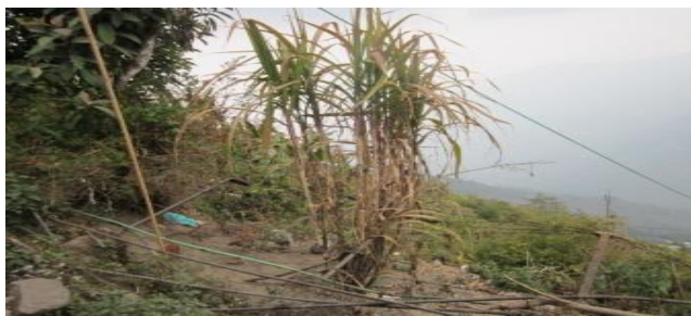
Figure 45-47: Dense Vegetation with Three layered canopy (>70 percent canopy cover) of trees on the ridges of Hills at Mulgaon forest, Bamboo thicket (Parang), Saccharum officinarum L. (Sugarcane locally called Ukhu) in the same village of Darjeeling, West Bengal, India