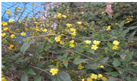
Figures 63-65: People carrying dry litter for fuel purpose; Doko used to carry Fodder plants; Yellow Jasmine: Jasminum humile L. (East Italian Yellow Jasmine) planted for ornamental purpose.