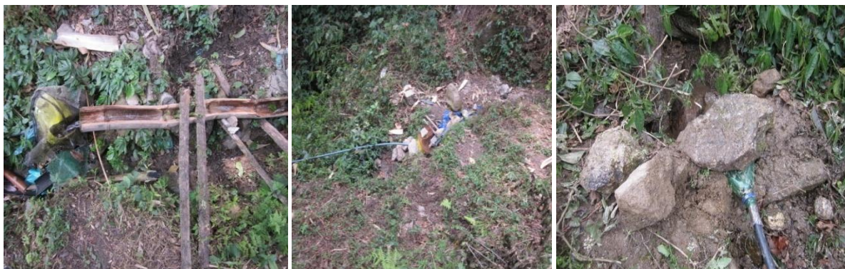
Figures: 33 (a, b, c) : Local technique to carry water from Source so called “kua or muhan” by which water is being collected to a big container called Thumbhi (Large reservoir) and from there water supplied to Village via a pipeline for a kilometer or more to carry water by the help of pillars of Trees in the hill slopes. First figure indicates Thumbhi, second and third figure for kua. Note that bamboos (half pipe) are used to carry water from Hills.