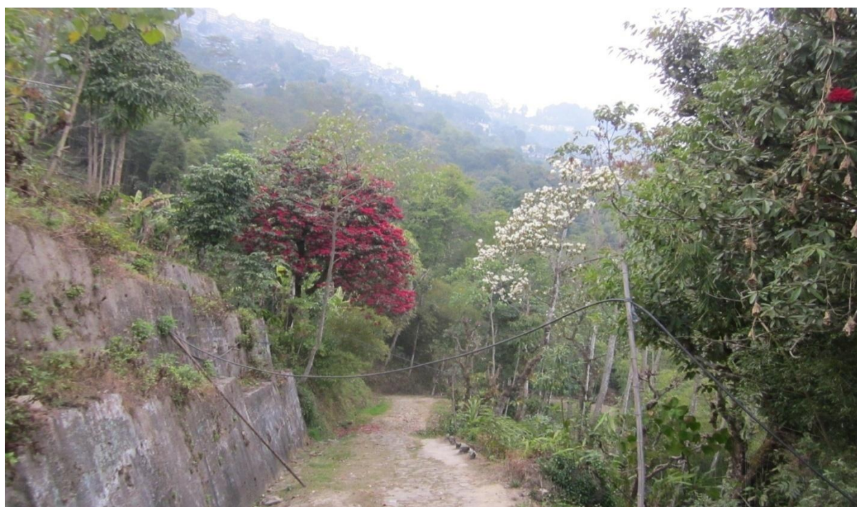
Figure 10: Left hand side of photograph showing Lali Guras ( Rhododendron arboreum) and Right hand side showing White Champ ( Michelia cathcartii) along the slopes of hill towards Pandam, Darjeeling during late monsoon