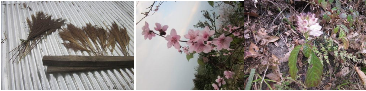
Figures 11-13: Drying flowering scapes of Thysalolaena maxima (Roxb.) O. Kuntz.(Left), Arucha: Prunus sp. (Middle) and Asystacia macrocarpa Nees of Acanthaceae (Right) showing flowering during monsoon at Jungle path of Pandam, Darjeeling, West Bengal, India.