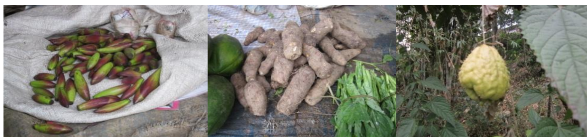
Figures 60-62: Kabra- Ficus benjamina L. var. comosa ; , Pindalu-(wild yam i.e. Alocasia sp.) -along with Papaya and Rai-ko-Sag, in a local market, Eskush- Sechium edule (Cucurbitaceae) hanging in a Bamboo thicket during winter near forest. (Note that four varieties of Eskush are available from Kalimpong and Darjeeling areas due to presence of colour and outer spines, one with pale yellow, one with light green, another is dark green, last one is spineless, the light green is very common. This species having light green ecotypes are cultivated throughout the area).