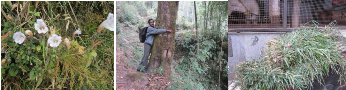
Figures 14-16: Goldfusia pentastemonoides Nees of Acanthaceae indicating village nearby as indicator species (Left); Author measuring GBH (Girth at breast Height) of Moua tree ( Engelhardia spicata ) at forest of Mulgaon at the middle; The fodder part of Bamboos is deposited in front of Stable near Chowrasta (Centre of four ways) is collected from Bamboo thicket.