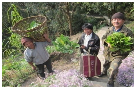
Figures 27-29 : Chitra i.e. covering made by Bhalu Bans, Pakhan bet and Vegetables collected from local garden at Golao gaon by Doko (Container/Basket made up of Bamboos), Darjeeling. Note that basket without holes are called Thumpsey/Tokri also used for the collection of tea leaves in garden and with holes is called Doco (Collection of fodder plants, wood, building materials etc.) at upper left. Pakahn bet locally used to relief the throat pain (Dried roots as whole and greens leaves without fabricated lamina) at the upper right. Vegetables collected by Golaigaon villagers at the bottom. Person at middle is resource person.