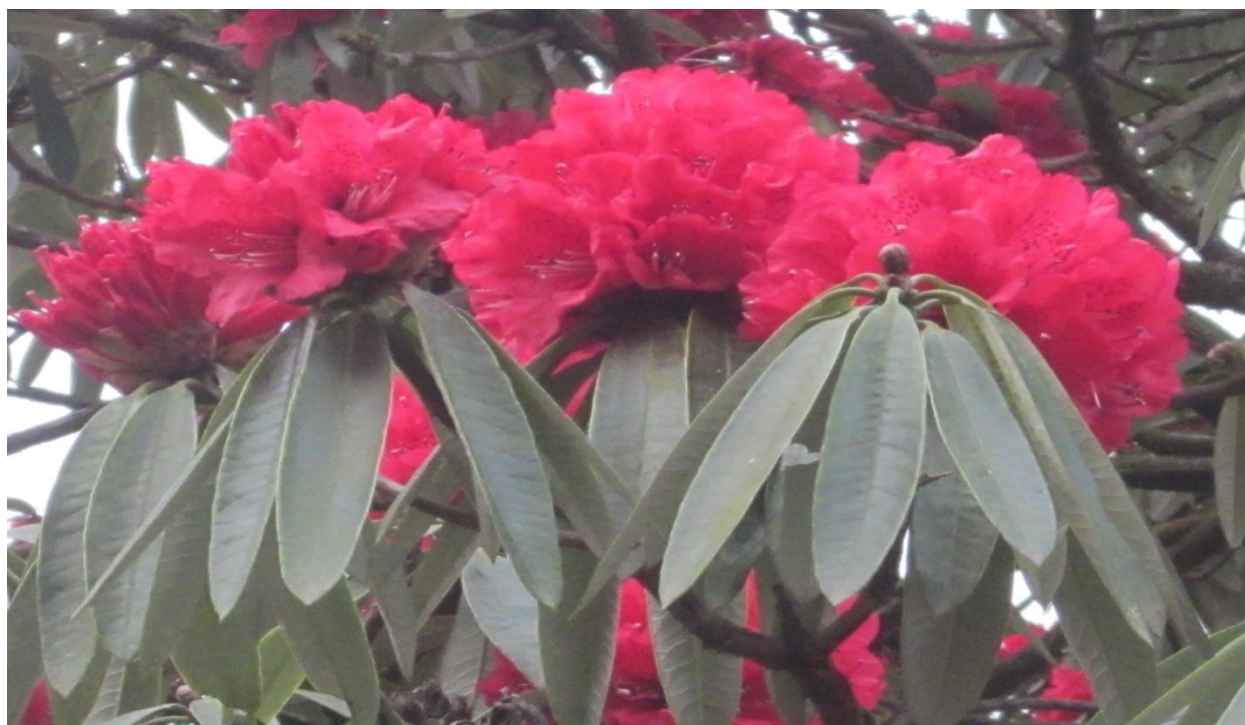
Figure 9: Rhododendron arboreum Smith (Lali Guras) blooming in stage at Pandam, Darjeeling.