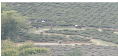
Figure 69: A Landscape diversity of Tea Garden in Eastern Himalaya, Darjeeling where people using Doko for plucking tea leaves, note that this picture is not a picture of Pandam Tea Estate, it is a Tea garden near Happy Valley Tea Estate, Darjeeling, a view from main road, Darjeeling towards Lebung.