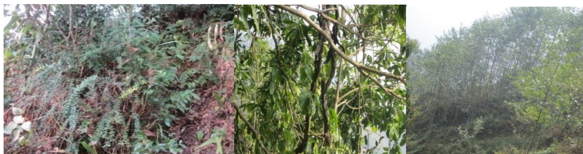
Figures 54-56: Agapetes serpens (Wight) Sleumer on rocky substratum (Bandre) at left, A large climber Mucuna macrocarpa Wall. (Baldhengra) at middle, and Alnus nepalensis D. Don (Utis) at right, Note that, the vegetation of utis at slopes may be 8-10 years.