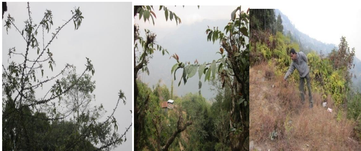
Figures 21-23: Bokey Timbur plant- Zanthozyllum sp. (Seeds used as condiments like Hing i.e. Ferula sp.), Ficus semicordata (Khanew) and Author collecting Seeds of some medicinal herbs during field visit (Photo by Kamal Kanta Roy, Non-teaching Staff of Zoology Department, Darjeeling Govt. College), Note that in Nepali word “Bokey” means Male Goat.