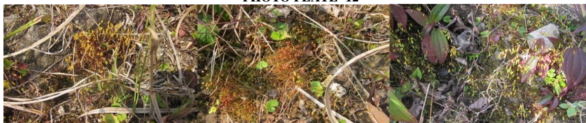
Figures 57-59: Polytrichum commune —community, note that the community having male as well as female plants, male having antheridial clusters and female having sporogonium on rocky substratum, underneath of shrubby vegetation nearby; Polytrichum commune —an endohydric moss community growing underneath tree shade on mildly acidic soil, the hairy cap coming out from capsule so the name hairy cap moss.