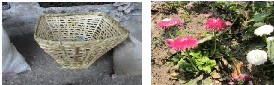
Figures 70-71: Doko of Chaya Bans (Left) and Himalayan Daisy (Pink and White) in village garden used for aesthetic purpose.