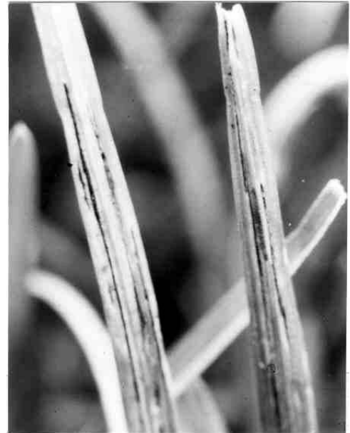
Figure 2. Dark streaks in Kentucky bluegrass due to leaf smut infection (courtesy D.H. Scott).

Short to long, narrow, and yellow-green streaks (sori) develop between the veins in infected leaves and leaf sheaths. These streaks soon become silvery to dull gray and extend the entire length of the leaf blade and sheath (Figure 2). The grass epidermis covering the streaks soon ruptures, exposing blackish brown, dusty masses of smut spores (teliospores). After dispersal of the spores, the leaves soon split and shred into ribbons, turn brown, curl from the tip downward, turn light brown and die. In addition, leaves of infected bluegrass and bentgrass plants tend to remain stiff and erect rather than lax and spreading. The symptoms are usually most evident in middle to late spring and autumn, when temperatures average 50° to 65°F (10° to 18°C). Affected plants do not tiller as profusely or produce as many rhizomes or stolons as healthy plants, nor do they develop as extensive a root system.