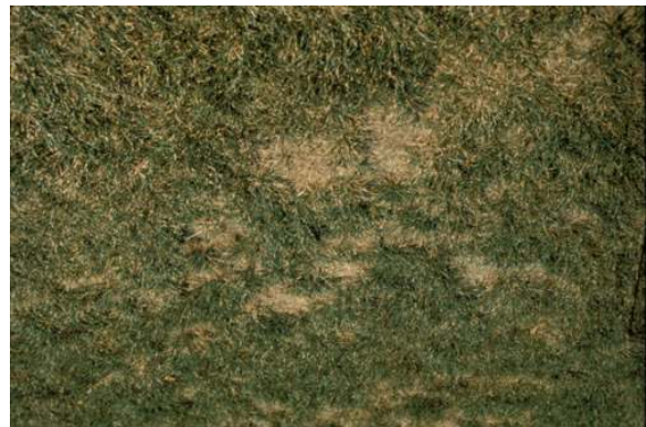
Figure 1. Severe stripe smut in Kentucky bluegrass.

The stripe and flag smut fungi infect about 100 species of turf and forage grasses, both cultivated and wild (Table 1). A number of highly specialized varieties and pathogenic races of these fungi are restricted to certain cultivars and species of grass. The diseases occur most commonly on annual bluegrass and Kentucky bluegrass