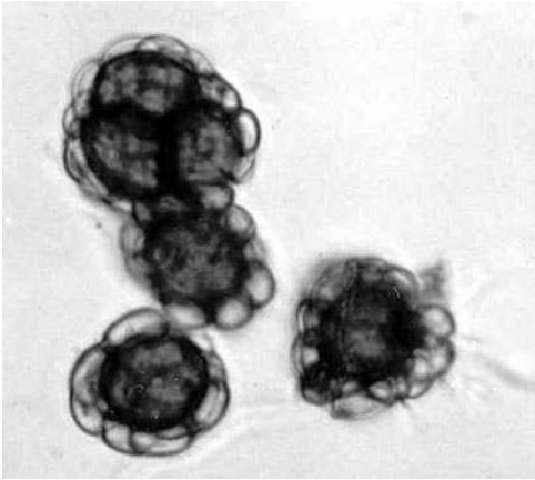
Figure 4. Four spores of flag smut fungus ( Urocystis agropyri ). (C.F. Hodges)

susceptible host tissue directly. Invasion may occur through the coleoptile of seedling plants and actively growing (meristematic) tissues produced by the lateral or auxiliary buds on the crowns, rhizomes, and stolons of older plants that come into contact with germinating spores. Once inside the grass plant, smut hyphae develop systemically in the direction of plant growth, with new leaves, tillers, rhizomes, and stolons becoming infected as they form. The mycelium continues to grow within developing tissues.