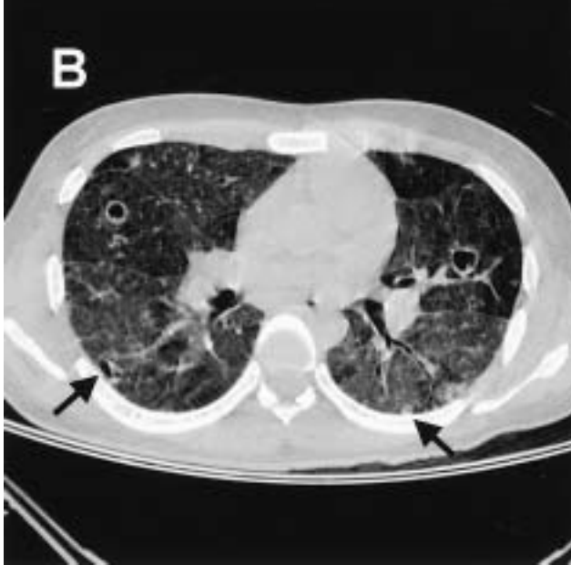
Figure 1. Image studies on the day of admission. ( A ) Chest radiograph shows bilateral nodular infiltrations. ( B ) CT scan reveals multiple thin-walled cavities. Some of them are located subpleurally (arrows).