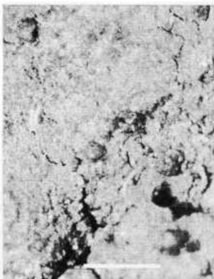
Fig. 1. Polyblastia nevoi (HOLO) habit. Scale 1 mm