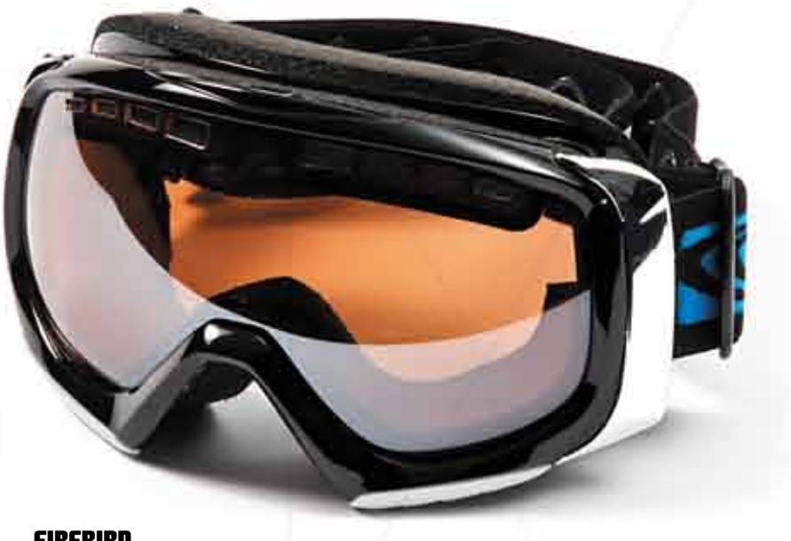
FIREBIRD 2010 BLACK ORANGE LENS