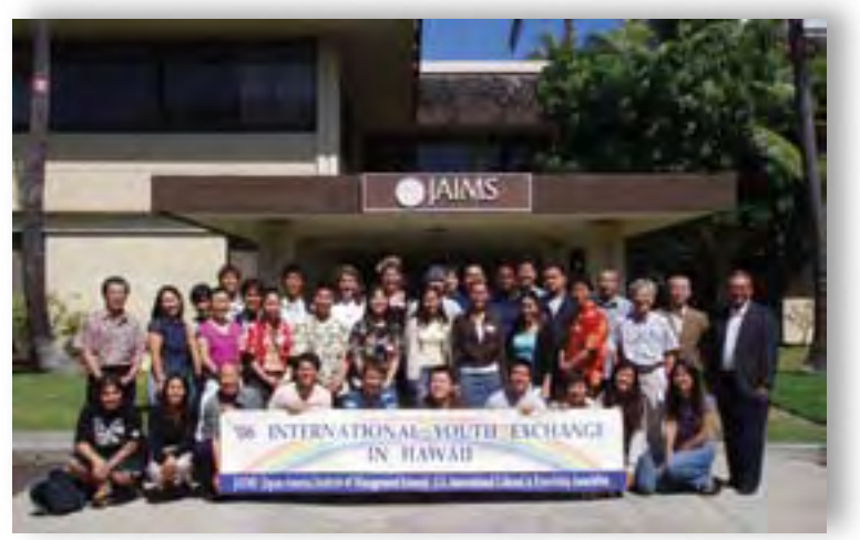
The International Cultural and Friendship Association with JAIMS students

In February, the International Cultural and Friendship Association (ICFA) visited Hawaii and spent a day at JAIMS. The purpose of the organization is to connect people and countries, to bridge boundaries of race, religion, & political ideology,