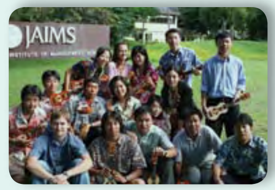
The ICMP 2005 Fall Class

The leverage of JAIMS graduates may come from management training, professional expertise, or bilingual ability. The worldwide network of the JAIMS Bond may be a part of the leverage. It is up to each of us to use our resources and cultivate that special something that will set us apart from the crowd.