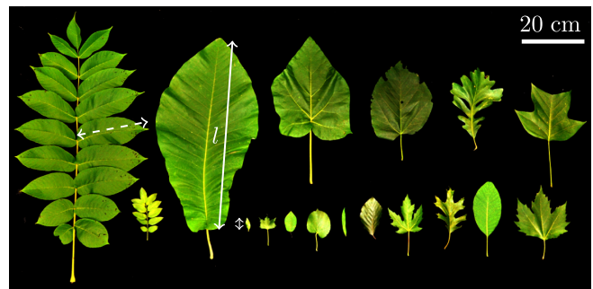
FIG. 1 (color online). Examples of leaf size variability. Typical leaf lamina length l (indicated by arrows) for a group of trees of height h \leq 30 m growing in North America. Leaf size varies from 3 cm in Ulmus parvifolia (Lacebark elm) to 60 cm in Magnolia macrophylla (Bigleaf magnolia). For compound leaves (left), leaflet length was used (dashed arrow). See the Supplemental Material Fig. 1 [8] for a complete list of species in the figure.

Lamina length of leaves l is highly variable among angiosperm tree species and varies from a few mm to over 1 m [7] (Figs. 1 and 2 and Supplemental Material [8]). The distribution shown in Fig. 2 is based on botanical descriptions covering 1925 species from 327 genera and 93 families. For each species, the data consist of a reported tree height h and range of leaf lamina length l , shown as the longest ( \Delta ) and shortest ( \nabla ) in Fig. 2.