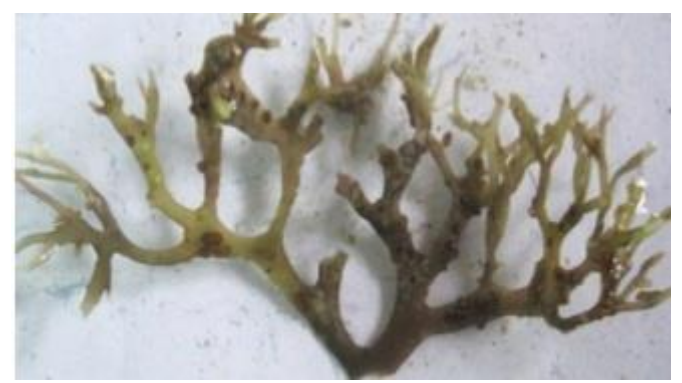
Fig.1. Photograph of Gracilaria corticata J.Ag.