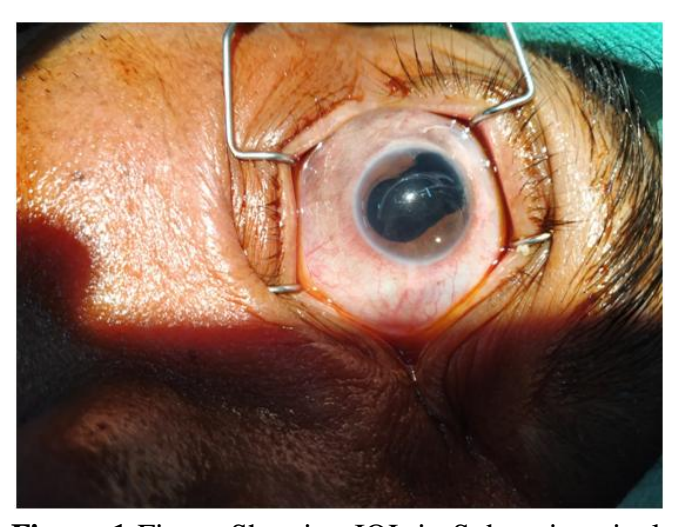
Figure 1 Figure Showing IOL in Subconjunctival Space with A U Shaped Pupil

fundus examination with 78 D lens revealed mild vitritis. Indirect Ophthalmoscopy showed normal peripheral fundus. B scan Ultrasonography of affected eve reported mildly increased frequency suggestive of vitreous inflammation. Subsequently patient underwent conjunctival peritomy with removal of haptic and PCIOL. Vitrectomy was done anteriorly and sclera was sutured with absorbable vicryl sutures. Anatomical integrity of eye was restored by formation of chamber. Vision got improved to finger counting at 3 meters. Vitreous was not incarcerated in the wound. After 6 weeks patient underwent sclera fixation of IOL along with vitrectomy through pars plana route in second sitting. The patient's visual condition came upto to 6/36 in right eye after 6 months of follow up. The intraocular pressure was 12 mm Hg at previous visit and fundus revealed mild disc pallor with vertical C:D ratio of 0.3 and macular scarring.