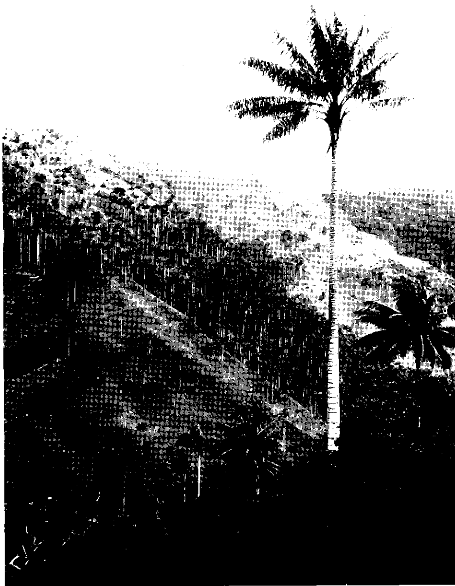
Figure 6. "They form forests (palmares) of columns which from afar look white like ivory, crowned by a sheaf of admirable leaves five to six meters and more in length. These forests are being diminished day by day." (André, 1877–1883: 35, 224).