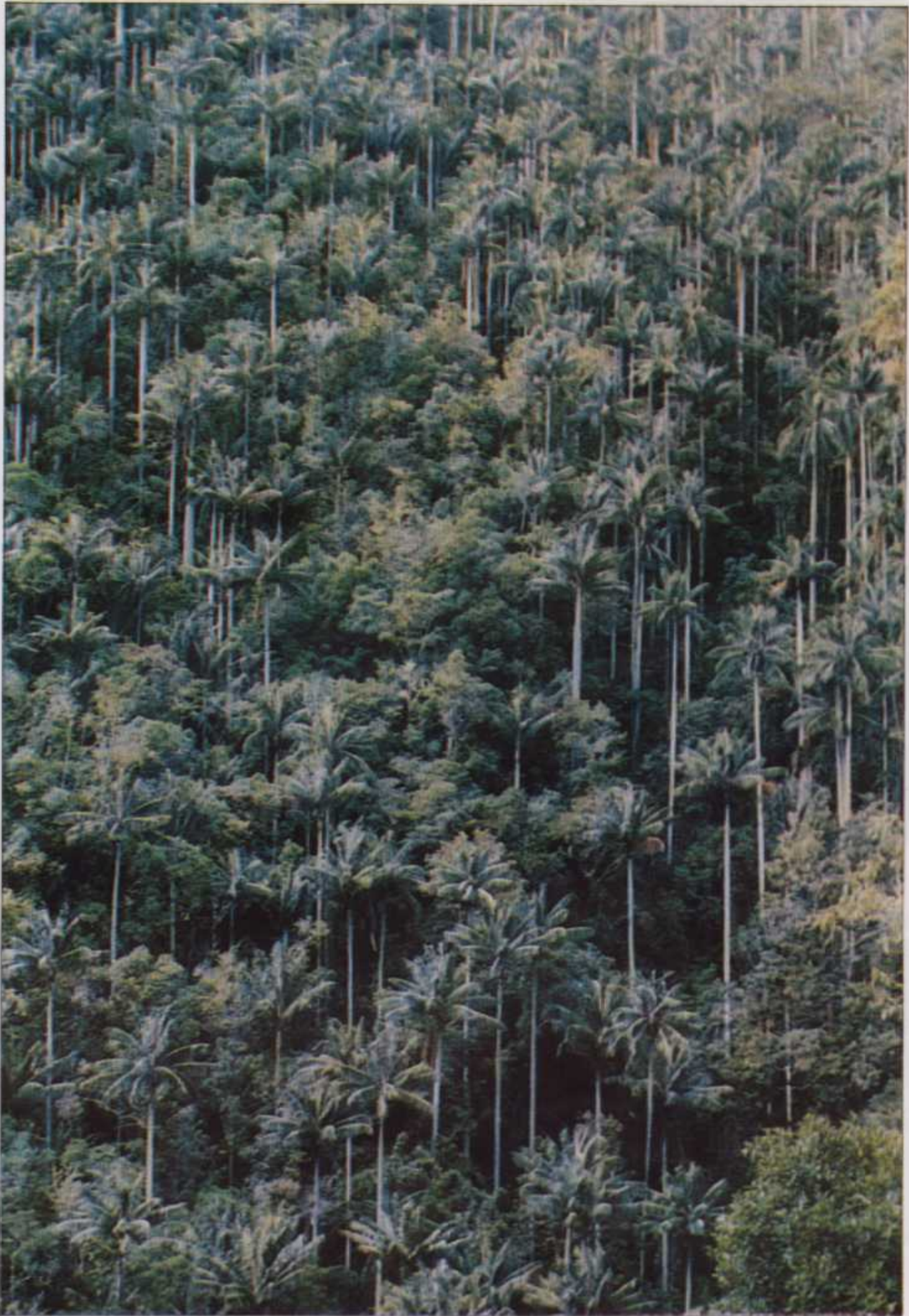
Figure 3. "In [the] forests of beauty of mountain wilds, the Quindío hardly has rival. The groves of the wax palms are to the most sublime of all the realm of the plant world" (Thielmann, 1879; quoted by Bomhard, 1937).