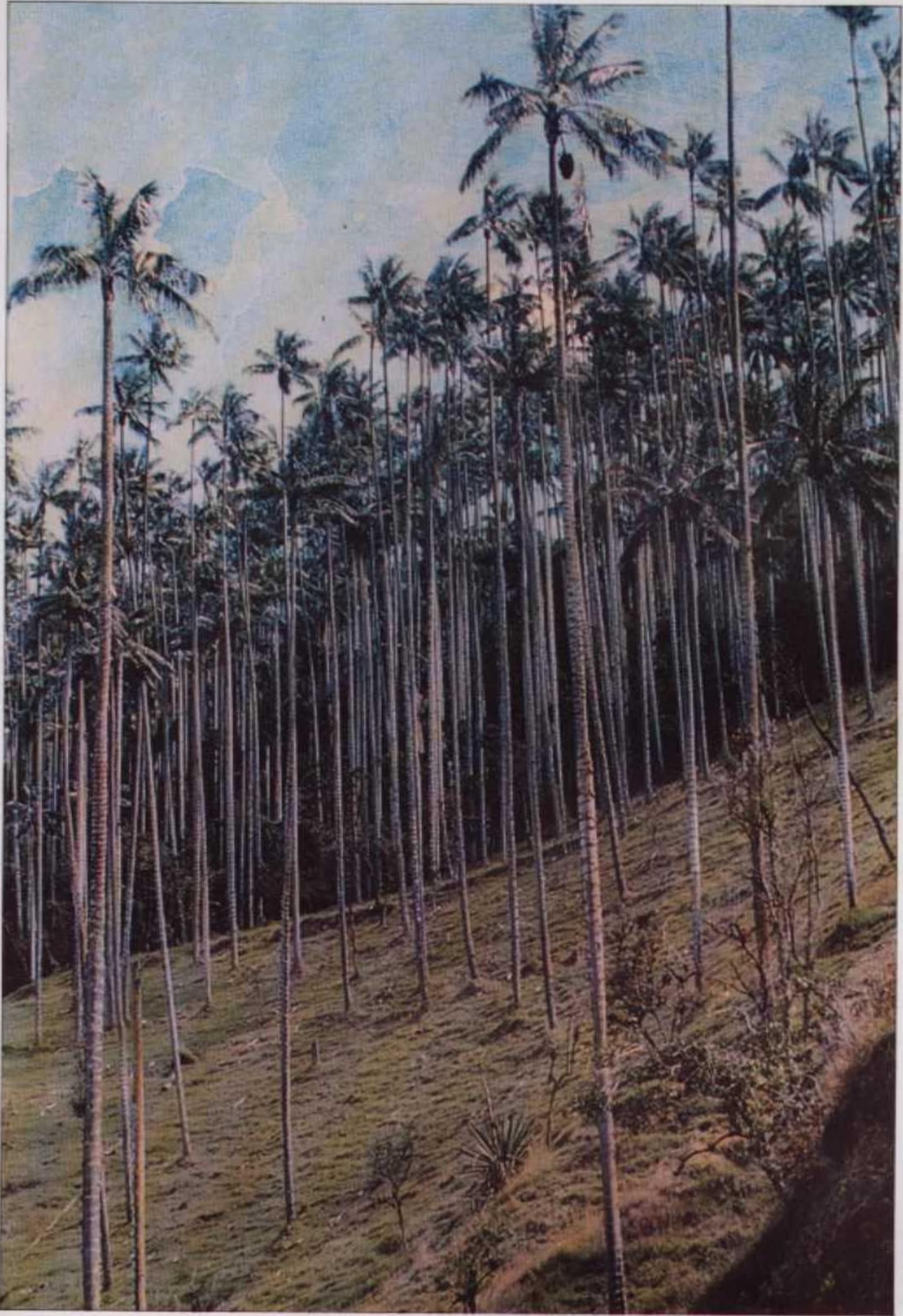
Figure 4. "The gigantic wax palm (Ceroxylon) rises in numerous group like white columns. From afar these parallel columns give the effect of masts of sail boats achored in harbor" (Boussingault, 1892-1903: IV, 154).