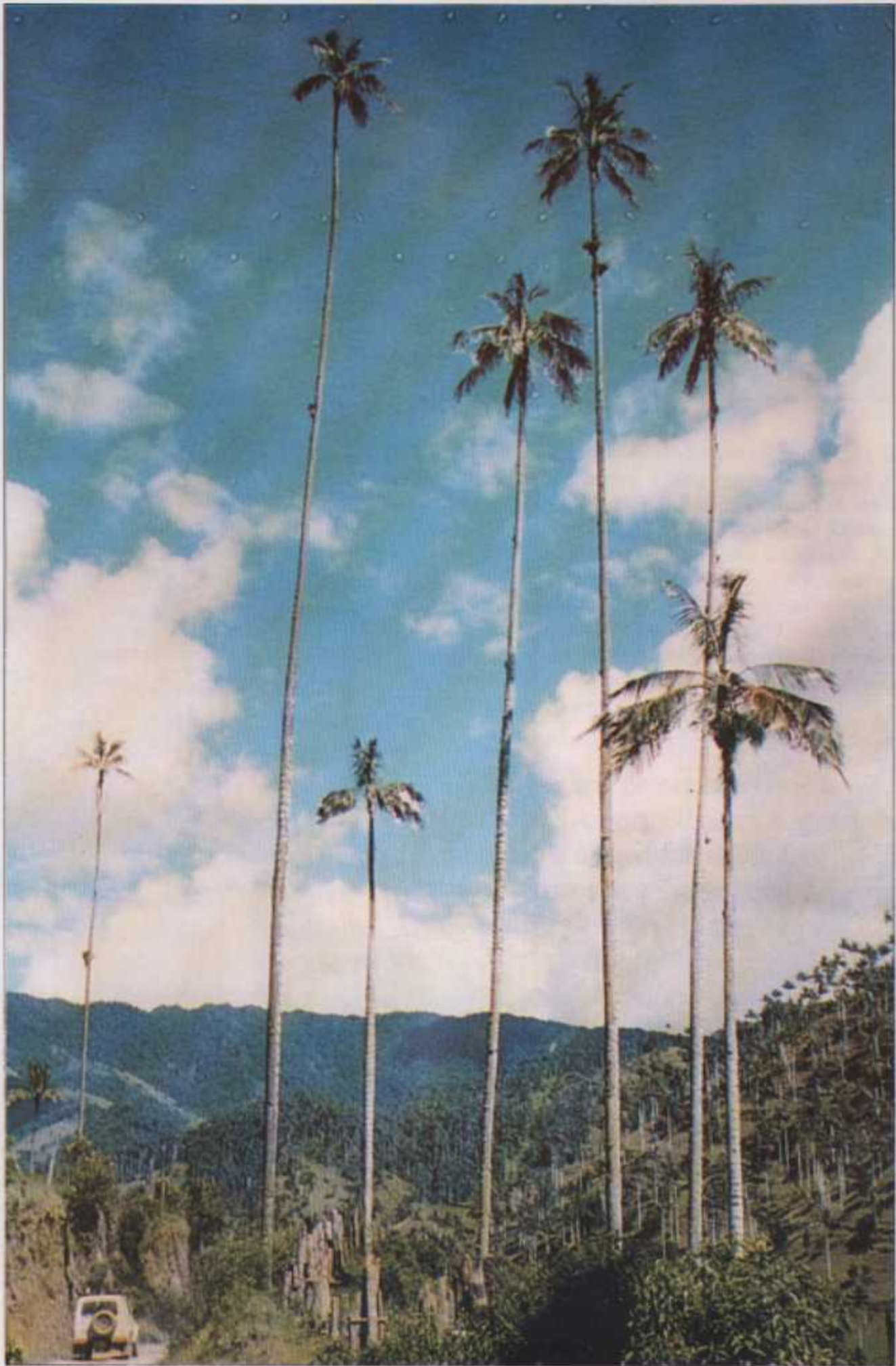
Figure 1. "The princes of the Principes" (Bomhard, 1937: 304). Ceroxylon quindiuense on the eastern slopes of the Central Cordillera (the Quindío Pass), Tolima, Colombia.