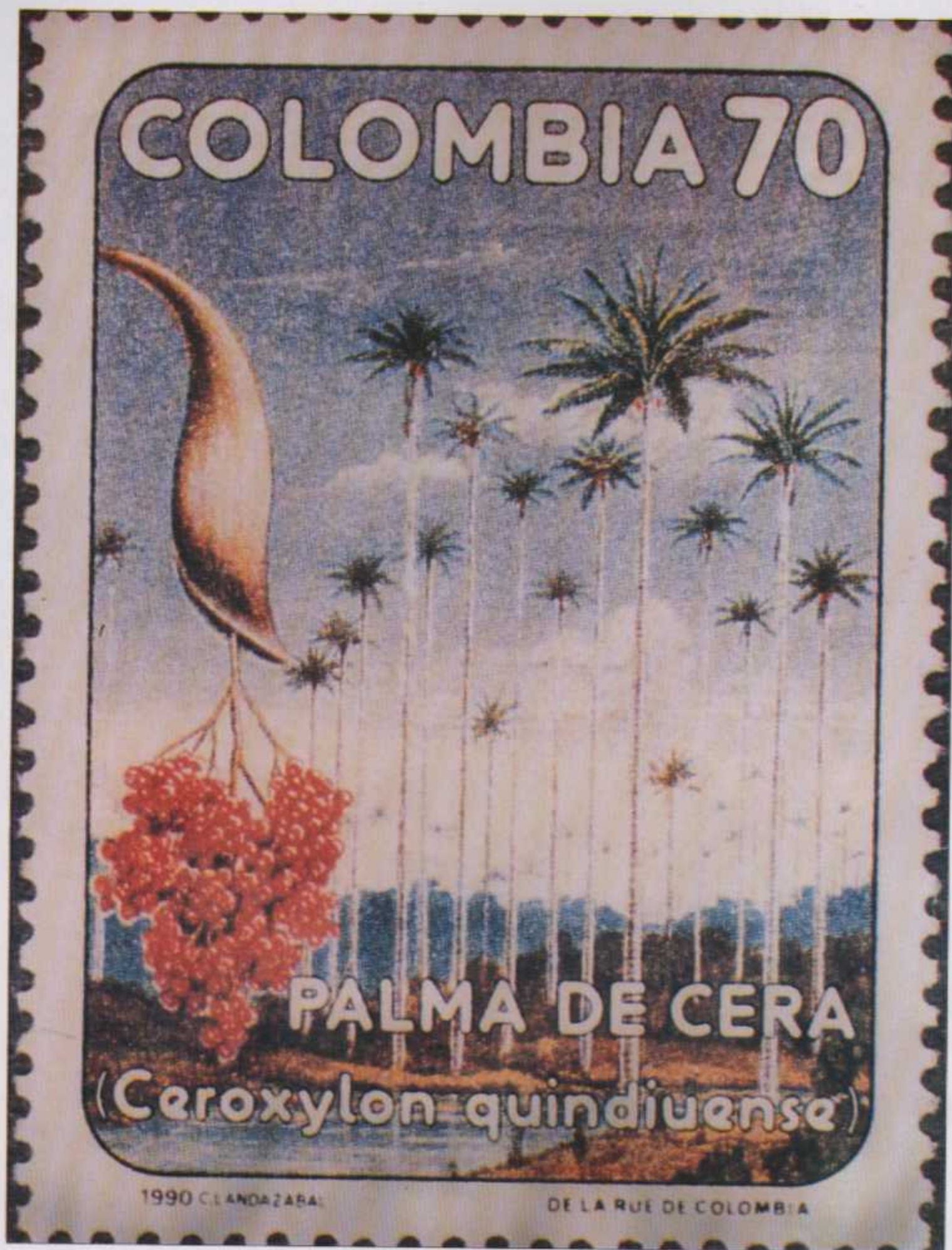
Figure 8. Postage stamp issued by the Colombian postal service honoring the national tree of Colombia.