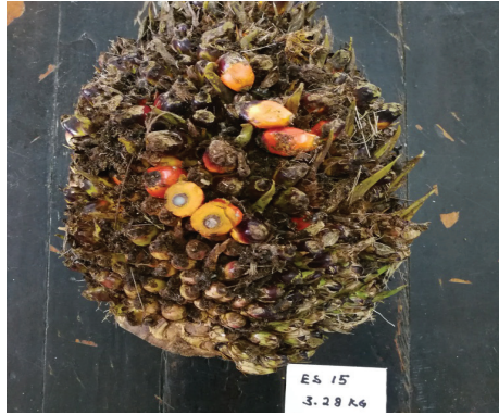
Figure 3a. Ripe oil palm fruit bunch with severe bunch moth infestation.