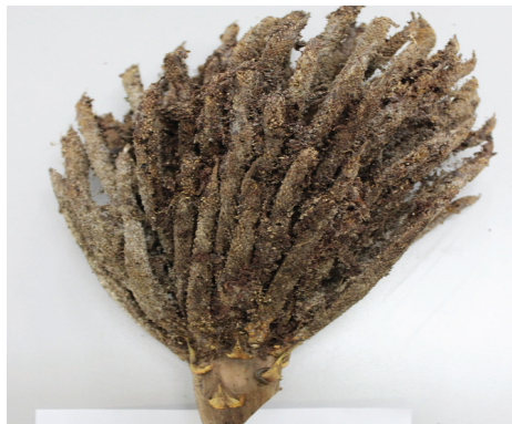
Figure 3b. Post-anthesis oil palm male inflorescence with severe bunch moth infestation.