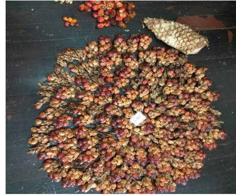
Figure 4. Spikelets of fruitlets after dissection.