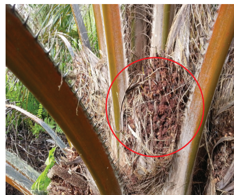
Figure 7a. Oil palm fruit bunches with severe new infestation covered by reddish faeces (red circle).

The severity of T. mundella infestation was classed into three categories and the number of pest larvae found in the inflorescences as well as the fruit bunches based on each category were determined. The mean number of larvae found per male inflorescence in severe category was 24 (rounded up figure), 11 larvae in moderate category and five larvae in light to clean category (Table 1). The mean number of larvae found