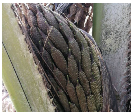
Figure 1b. Light to clean oil palm male inflorescence.