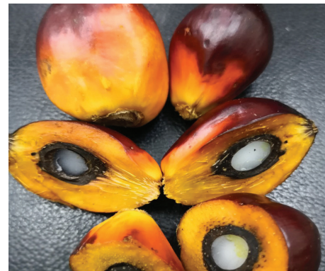
Figure 5a. Fertilised fruitlets: fully formed fruitlets with kernel and nut.