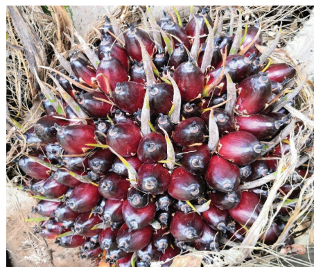
Figure 1a. Light to clean oil palm fruit bunch.

Thirty oil palm male inflorescences and 30 fruit bunches in each category (light to clean, moderate and severe) were further assessed to evaluate the