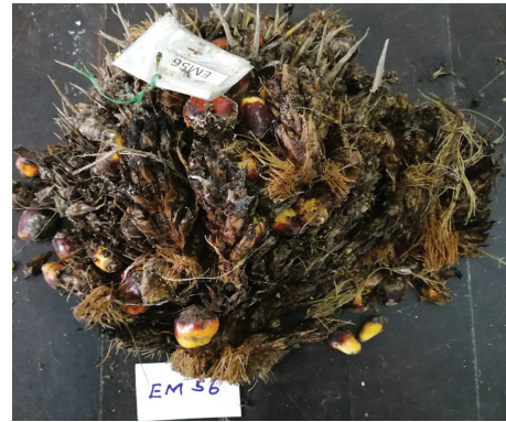
Figure 8. Aborted and rotten oil palm fruit bunch associated to severe Tirathaba mundella infestation.

become aborted due to destruction of the kernel. The fruit bunches in this severity category could continue to develop into maturity. The ripened bunches were with portions of undeveloped fruitlets and corky appearance as the outcome of mesocarp damage by the pest. For severely infested fruit bunches, the damage could lead to bunch abortion (Figure 8), and put the bunch development to a halt.