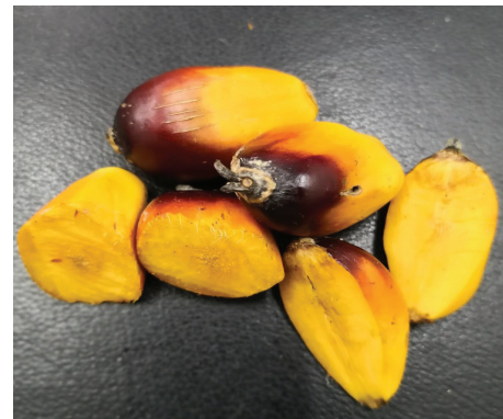
Figure 5b. Parthenocarpic fruitlets: fully formed fruitlets without kernel and nut.

average number of larvae present in each category. All fruit bunches and male inflorescences were dissected and the larvae residing in the sample were extracted. After each dissection, the sample was soaked in clean water for 5 min to capture the remaining larvae. Total number of larvae and their instar stages were recorded. The larvae count data were subjected to logarithmic transformation to normalise and after transformation, the larvae count data responded were subjected to analysis of variance using statistical analysis system (SAS) version 8.2.