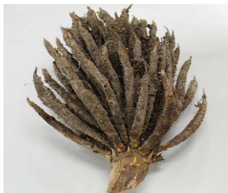
Figure 2b. Post-anthesis oil palm male inflorescence with moderate oil palm bunch moth infestation.