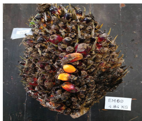
Figure 2a. Ripe oil palm fruit bunch with moderate oil palm bunch moth infestation.