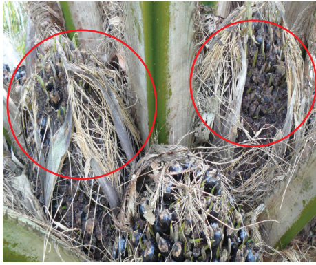
Figure 7b. Oil palm fruit bunches with severe old infestation covered by brownish black faeces (red circles).

in oil palm fruit bunches were 22 larvae in the severe category, 10 larvae in moderate category and two in light category (Table 1).