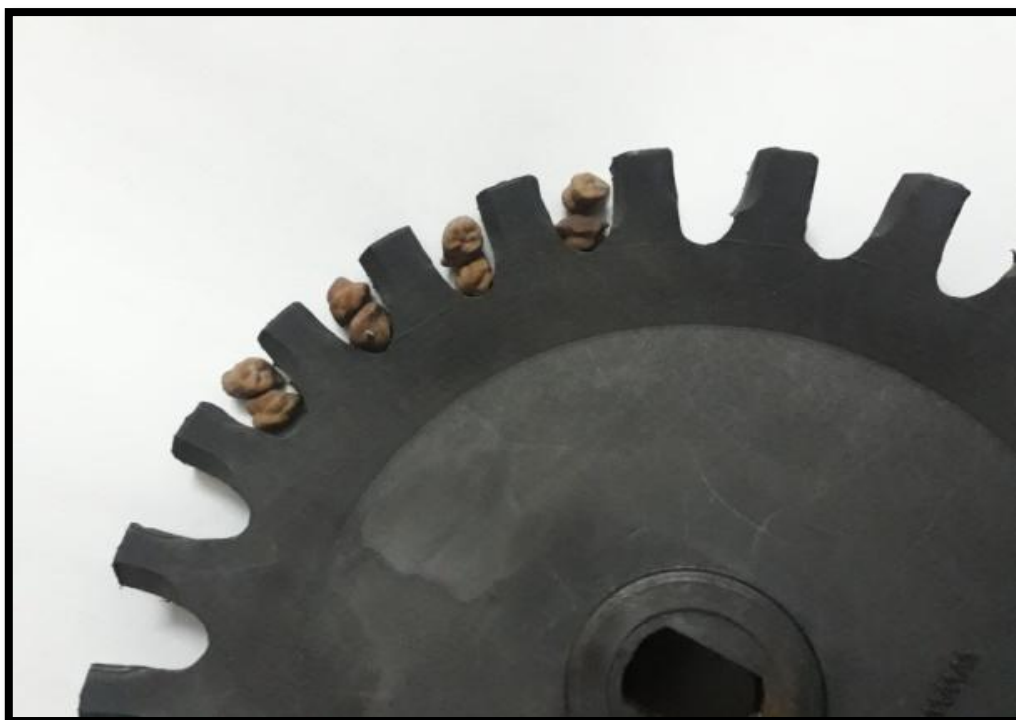
Fig. Seed metering plate with two seeds in each cell