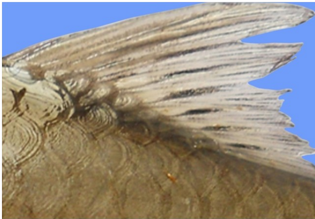
Figure 3: Dorsal fin of Puntius viridis