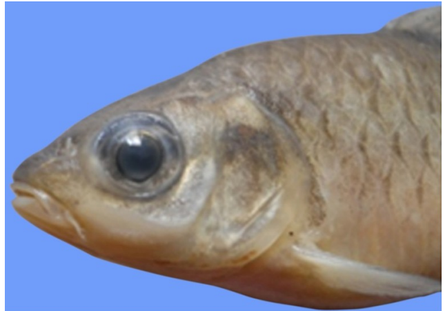
Figure 4: Head region of Puntius viridis

33.8 in % of SL (vs. 36.2- 37.3), eye diameter 26.1- 31.6 in % of HL (vs. 34.7- 36.0) and head depth 68.2- 80.0 in % of HL (vs. 80.3- 86.7). The new species differs from Puntius parrah in having nine pre dorsal scales (vs. 8 in P. parrah ), a deep black caudal spot (vs. diffused caudal spot), green dorsal and caudal fin (vs. dusky dorsal and caudal fin), longer head, 26.4- 31.1 % of SL (vs. 25.6- 26.0), shorter caudal peduncle, 16.3- 17.8 % of SL (vs. 19.1- 21.2) and shorter head depth (68.2-80.0 vs. 84.2- 89.5 % of HL); the new species differs from Puntius madhusoodani in having 4½- 5½ scales between lateral line and dorsal fin (vs. 4 scales), 8 branched rays in dorsal fin (vs. 7), 5 branched rays in anal fin (vs. 6), a deep black caudal spot (vs. diffused caudal spot) and lesser body depth at dorsal fin origin (31.5- 33.8 vs. 34.5 - 36.2); the new species can be differentiated from Puntius chola in having 8 anal fin rays (vs. 7 in P. chola ), 10-12 pre anal scales (vs. 12-13), 9- 10 circumpeduncular scales (vs. 11- 12), protrusible mouth (vs. non- protrusible mouth) and a row of black spots present in the middle of dorsal fin (vs. absent).