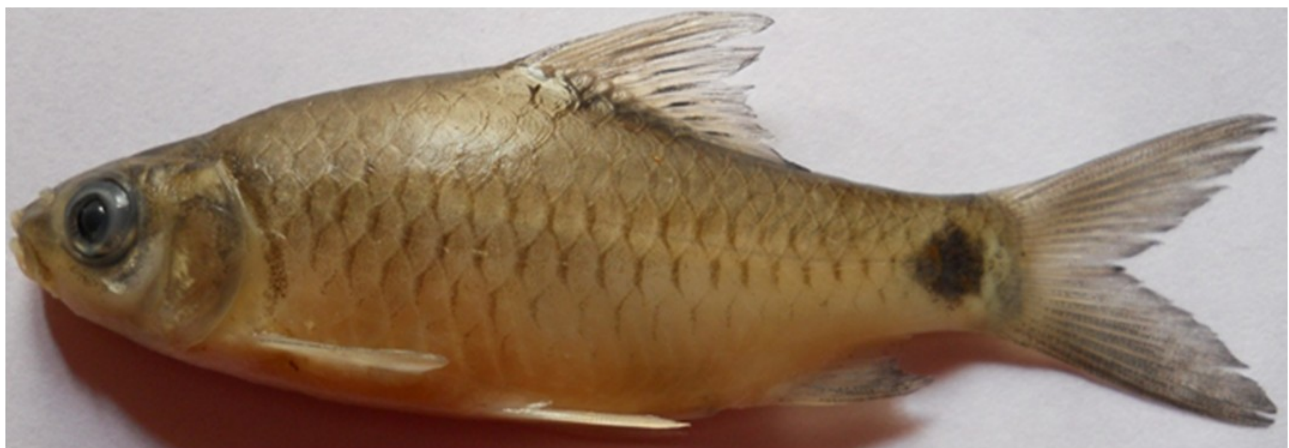
Figure 2: Puntius viridis , sp. nov, (preserved in formalin), Holotype, 81 mm SL, ZSI/ WGRC/IR/2382.