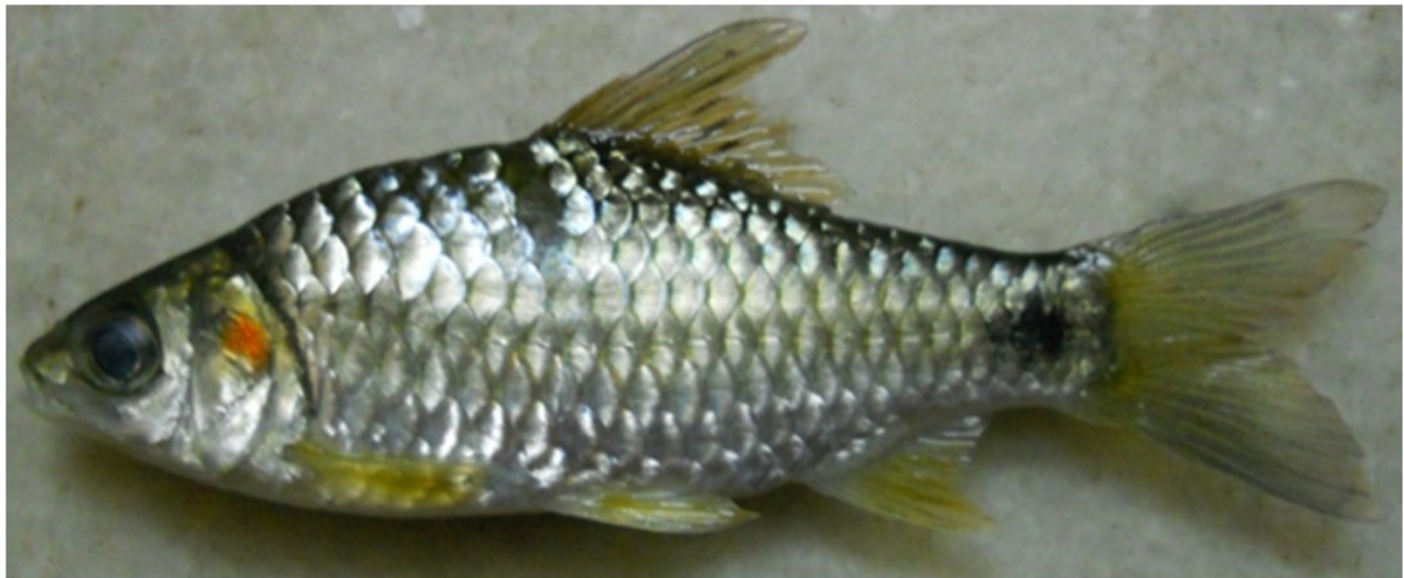
Figure 1: Puntius viridis , sp. nov, (fresh specimen), Paratype, 76 mm SL, ZSI/WGRC/IR/2383.

Puntius viridis can be differentiated from P. dorsalis in having a terminal mouth (vs. sub terminal mouth), a comparatively short snout (22.7- 31.8 vs. 31.8 - 37.1 in % of HL), LL/V 3½ (vs. 2½) and caudal fin with 18- 19 rays (vs.17). The new species differs from Puntius sophore in having 10- 12 pre anal scales (vs. 13 pre anal scales in P. sophore ), 3½ scales between lateral line and anal fin (vs. 4½), a black band present outer to operculum (vs. black band absent), a black blotch present in front of occiput (vs. black blotch absent) and absence of spot on the base of dorsal fin (vs. black spot present at the base of dorsal fin), body depth at dorsal origin 31.5-