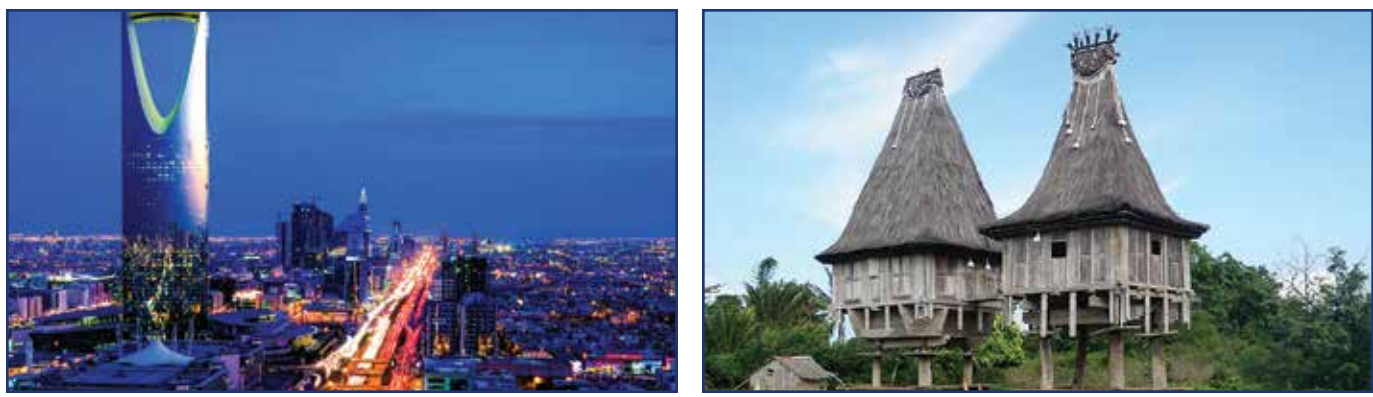
RIYADH, SAUDI ARABIA